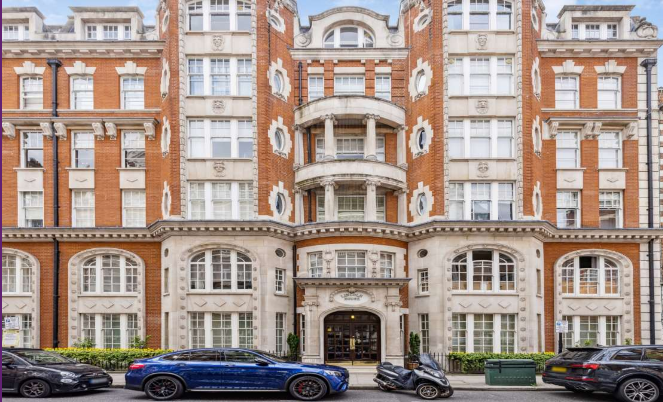
Lincoln House Basil Street, SW3