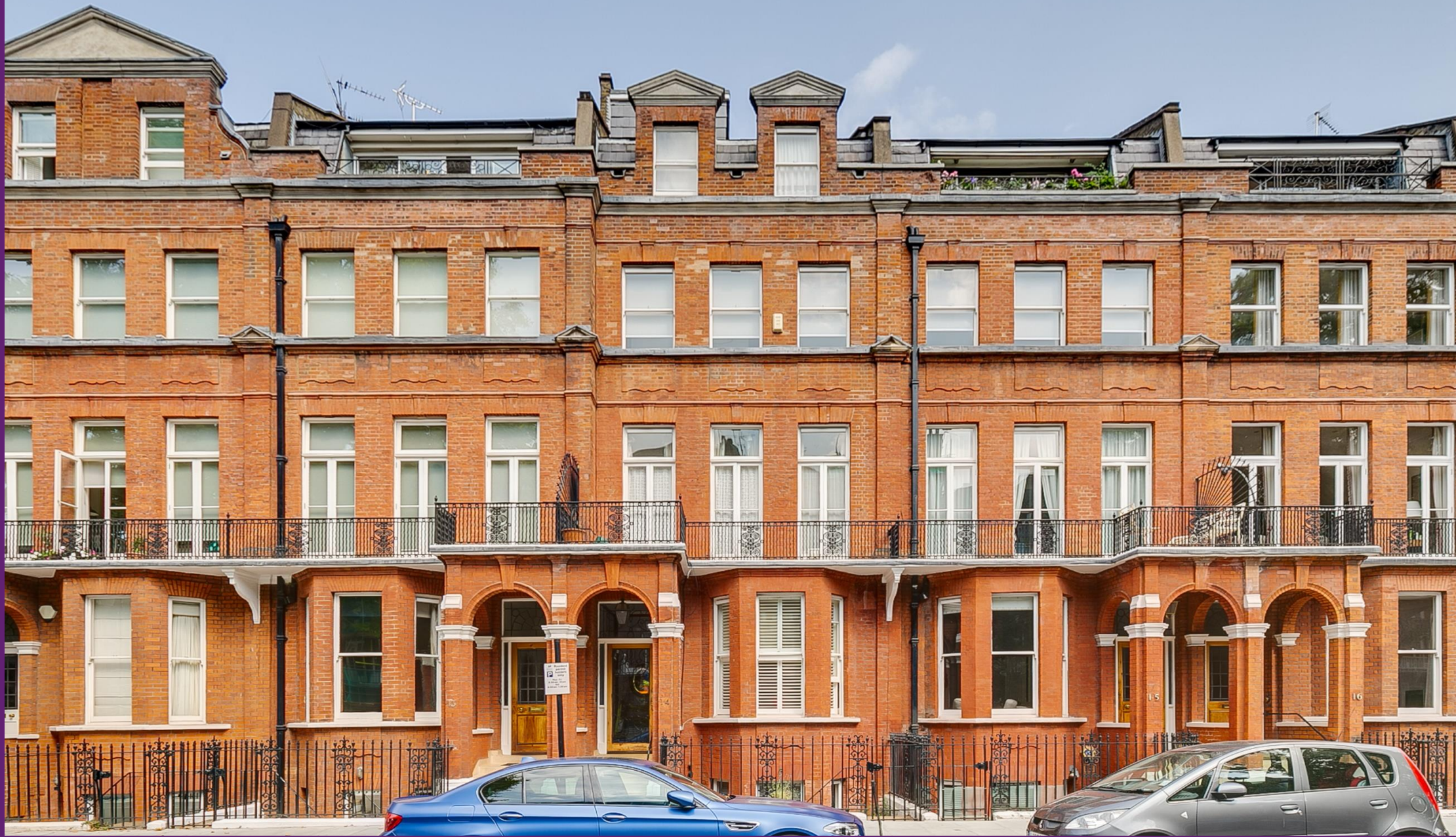
Cheyne Gardens Chelsea, SW3