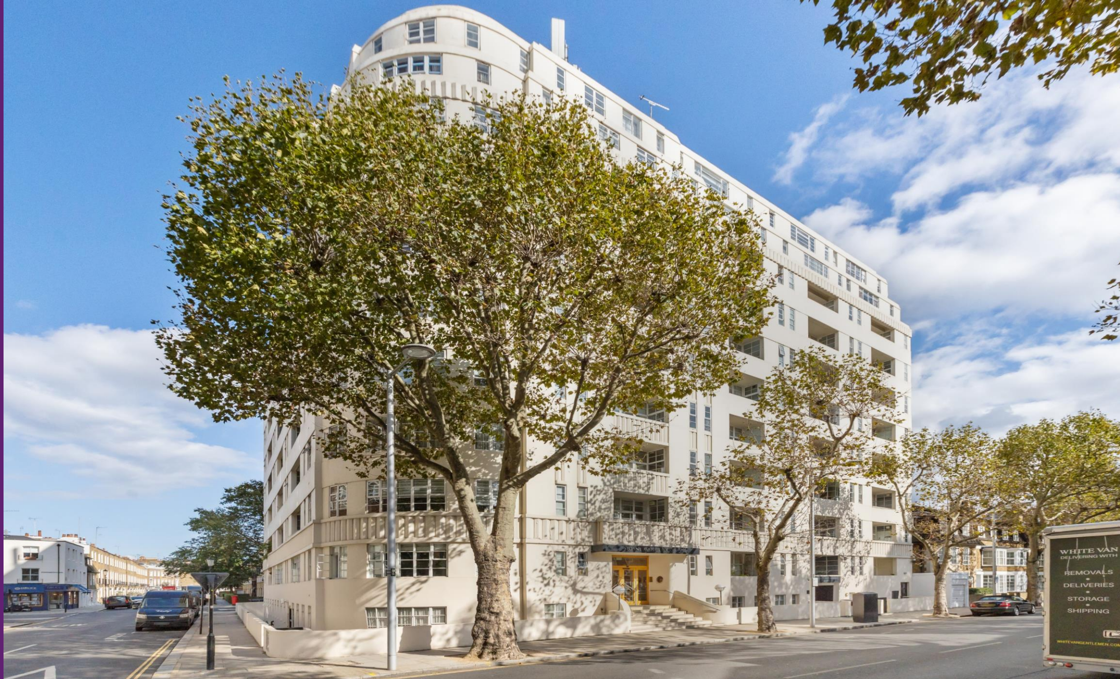
Sloane Avenue Mansions Sloane Avenue, SW3