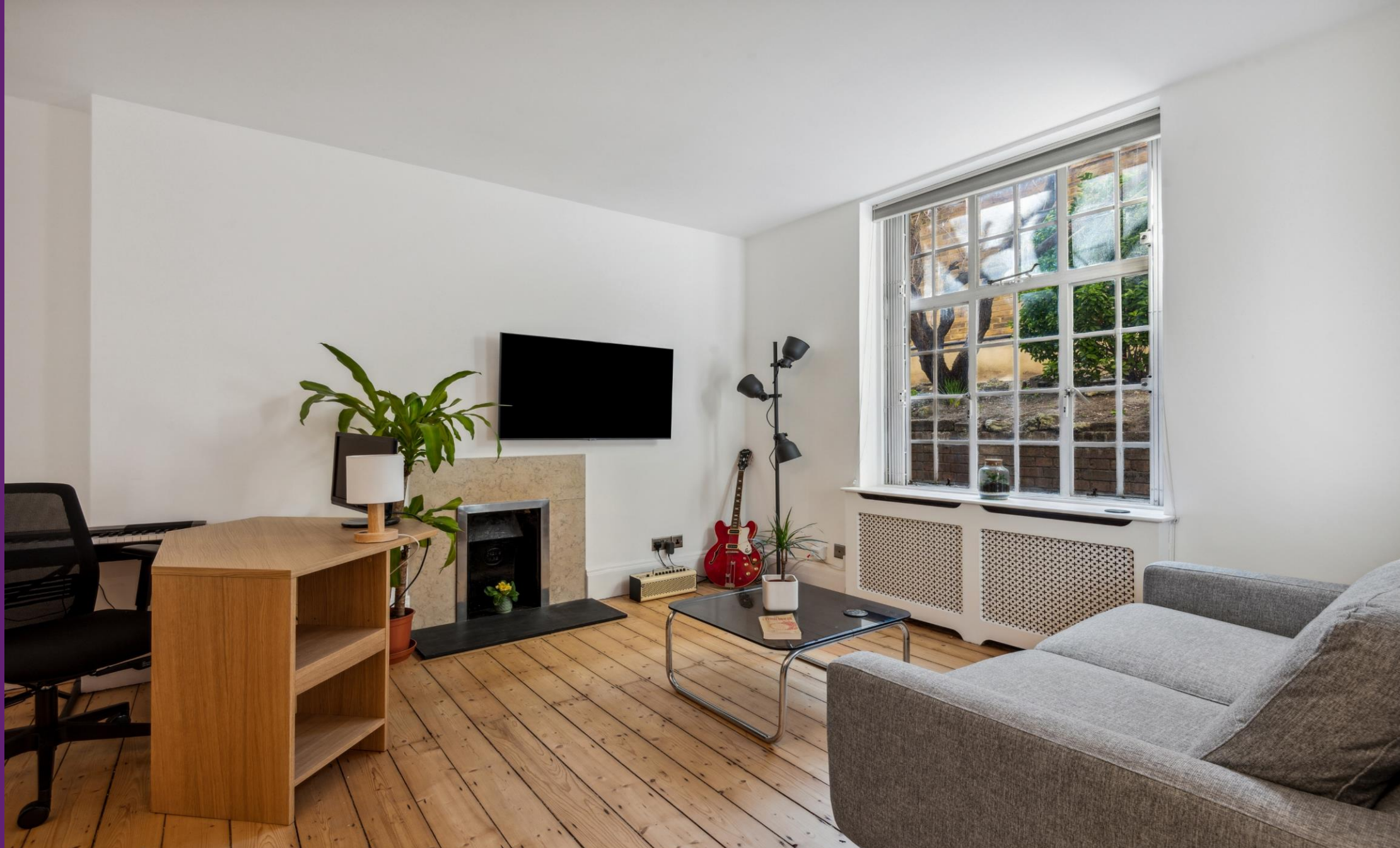
Meriden Court Chelsea Manor Street, SW3