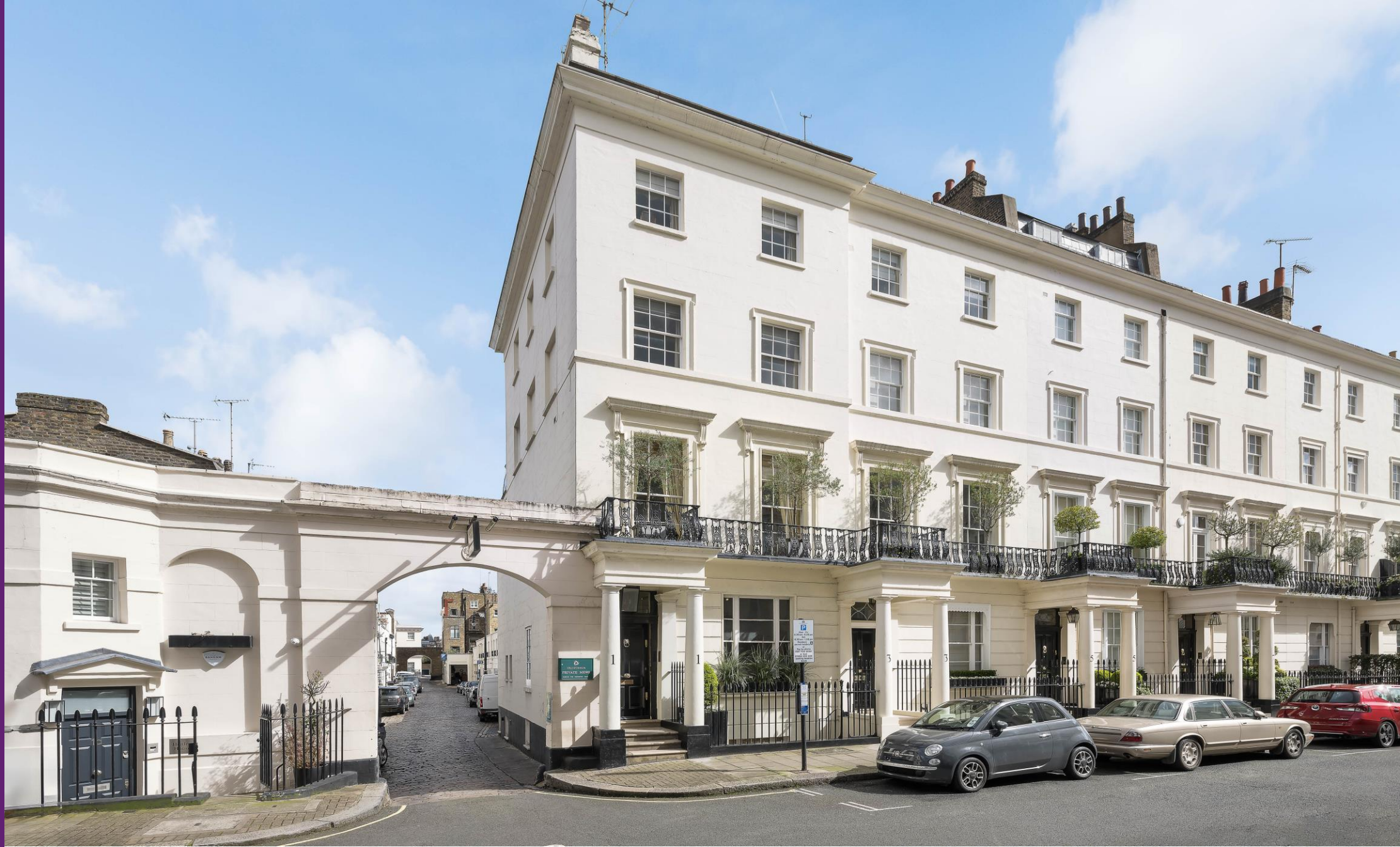
South Eaton Place London, SW1W