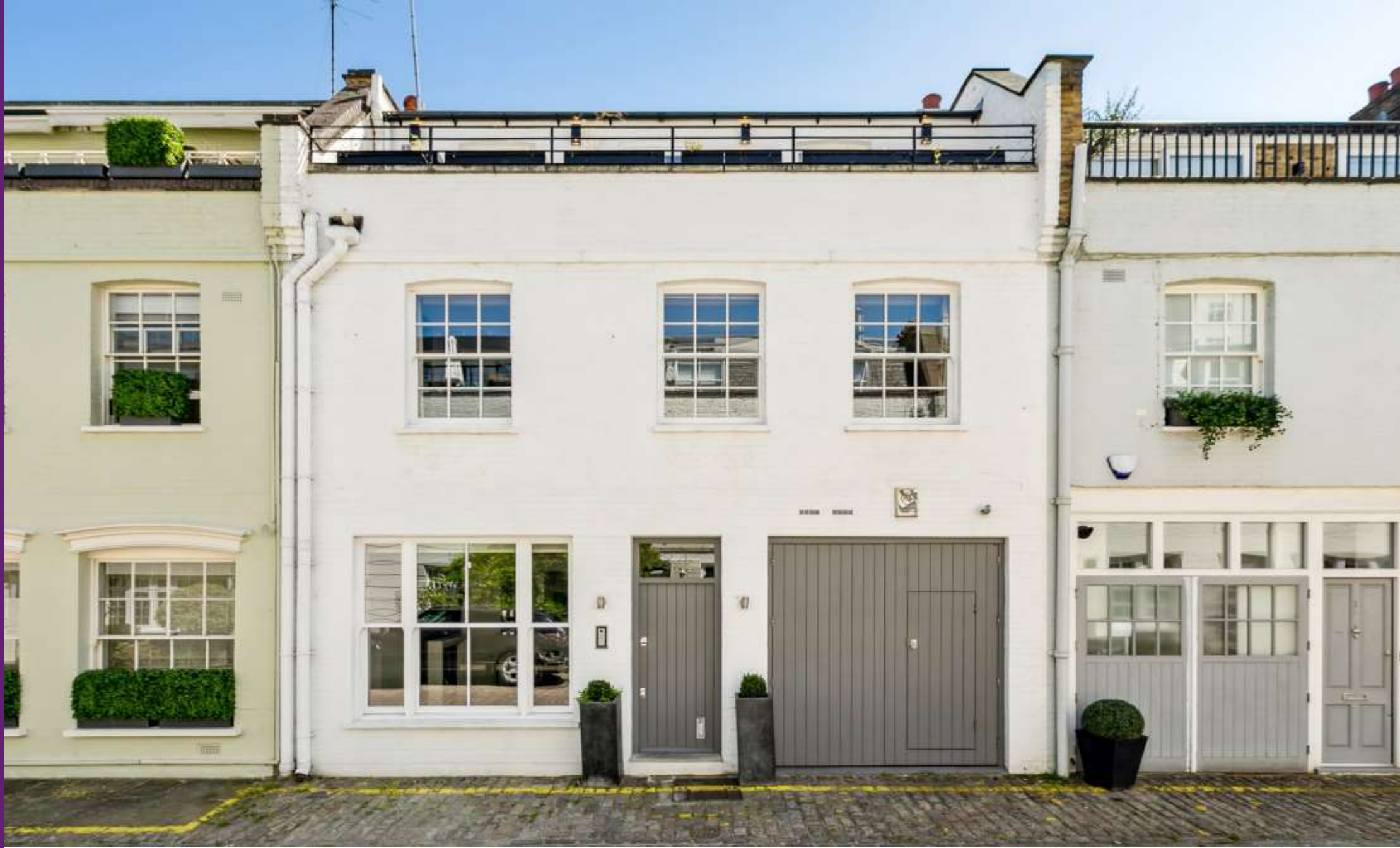
Princes Gate Mews Knightsbridge, SW7