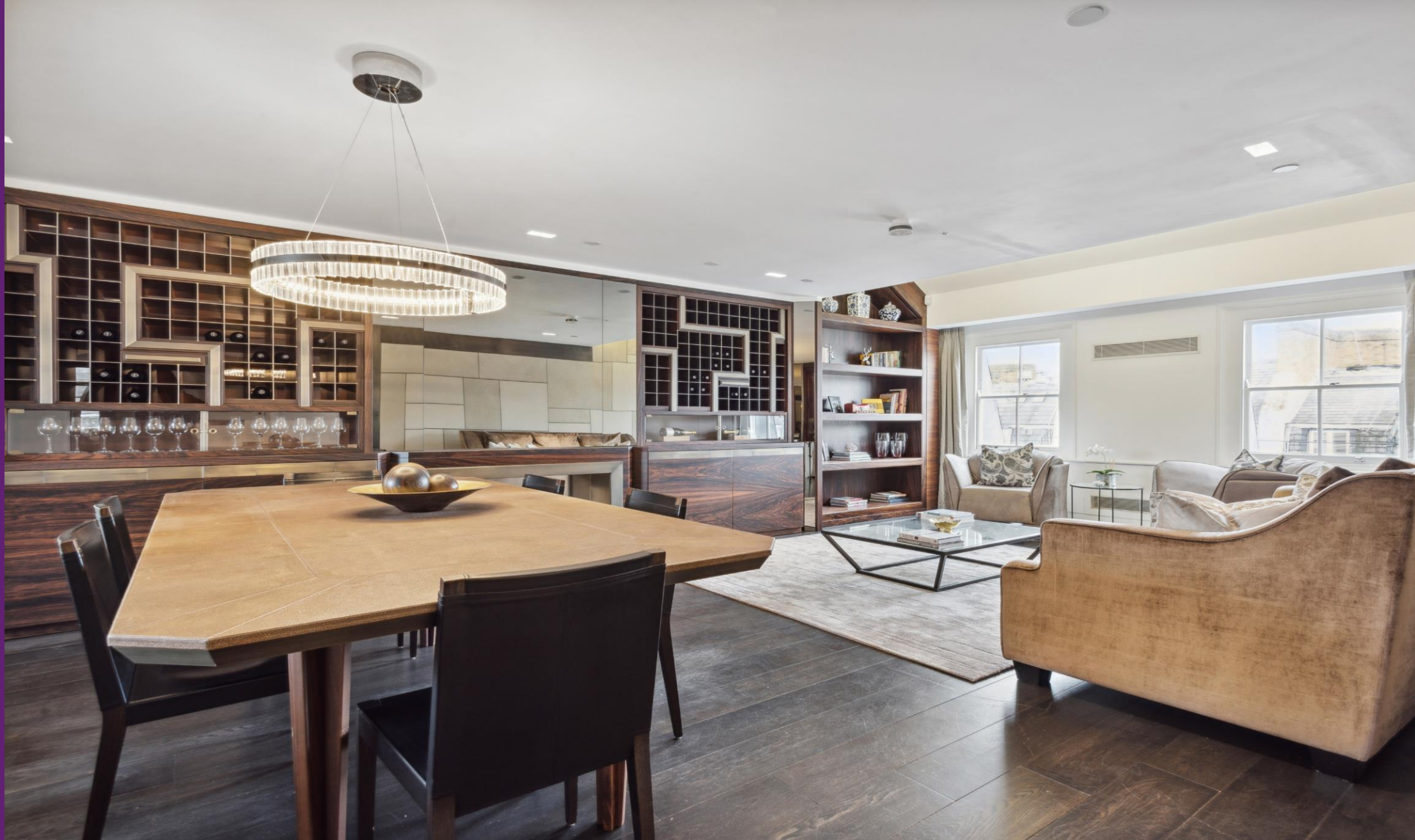
Carysfort House 14 West Halkin Street, SW1X