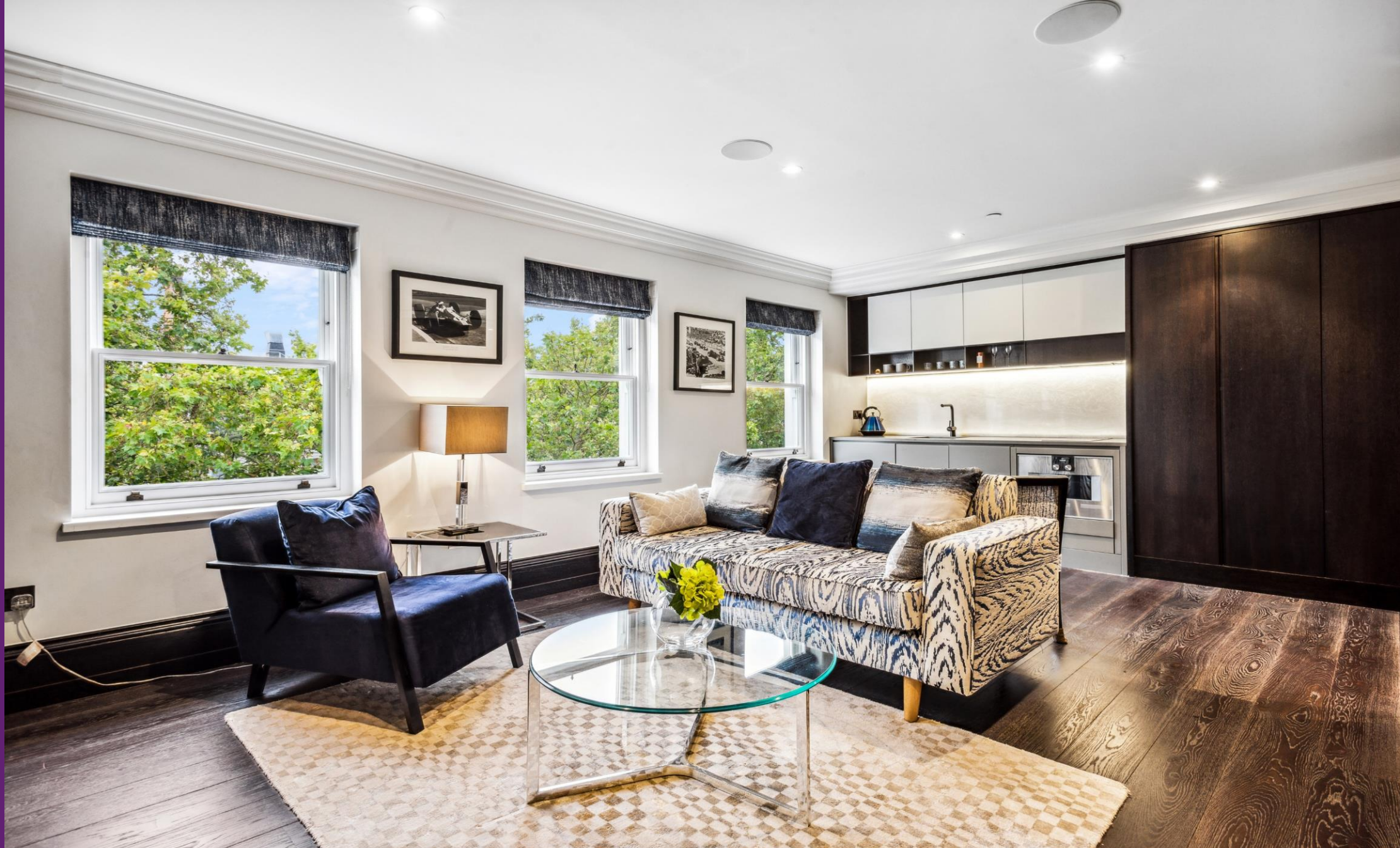
Beaufort Gardens London, SW3