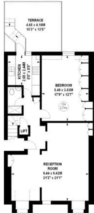
836 sq ft Fourth Floor