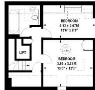
485 sq ft Fifth Floor

The floor plan is not to scale and measurements and areas shown are approximate and therefore should be used for illustrative purposes only. The plan has been prepared in accordance with the RICS code of Measuring Practice and whilst we have confidence in the information produced, it must not be relied on. If there is any aspect of particular importance, you should carry out or commission your own inspection of the property.