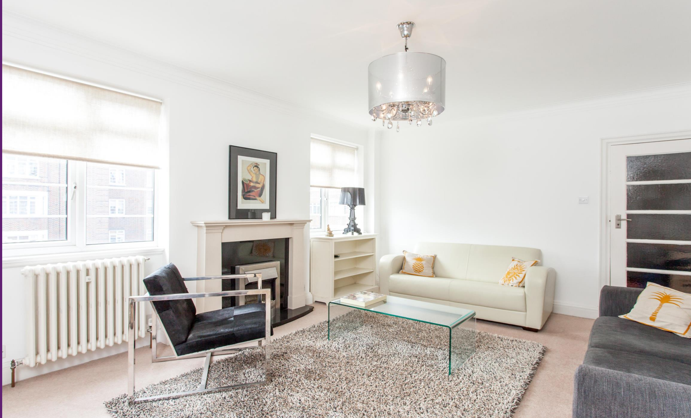
Chatsworth Court, Pembroke Road Kensington, W8