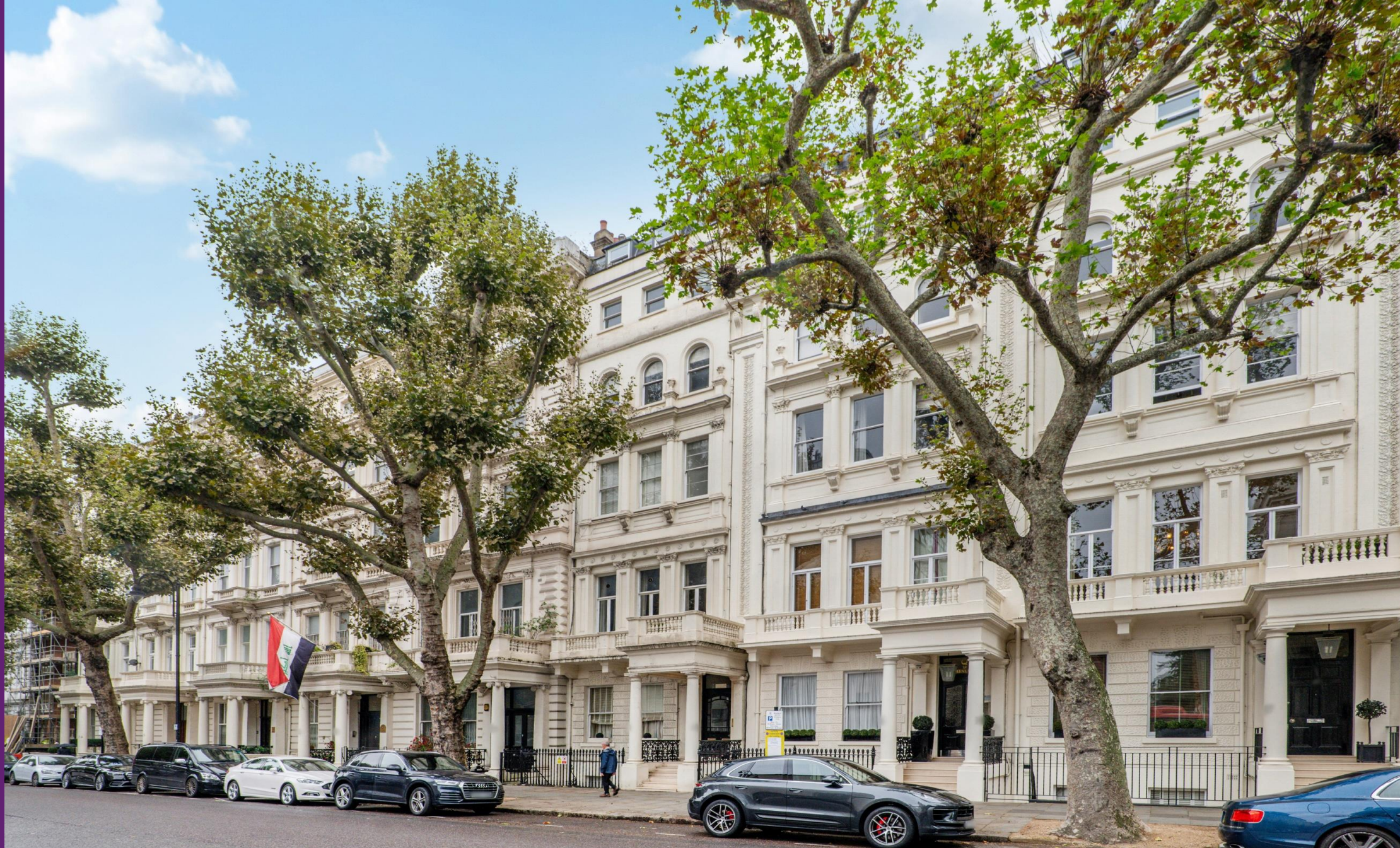
Queens Gate South Kensington, SW7