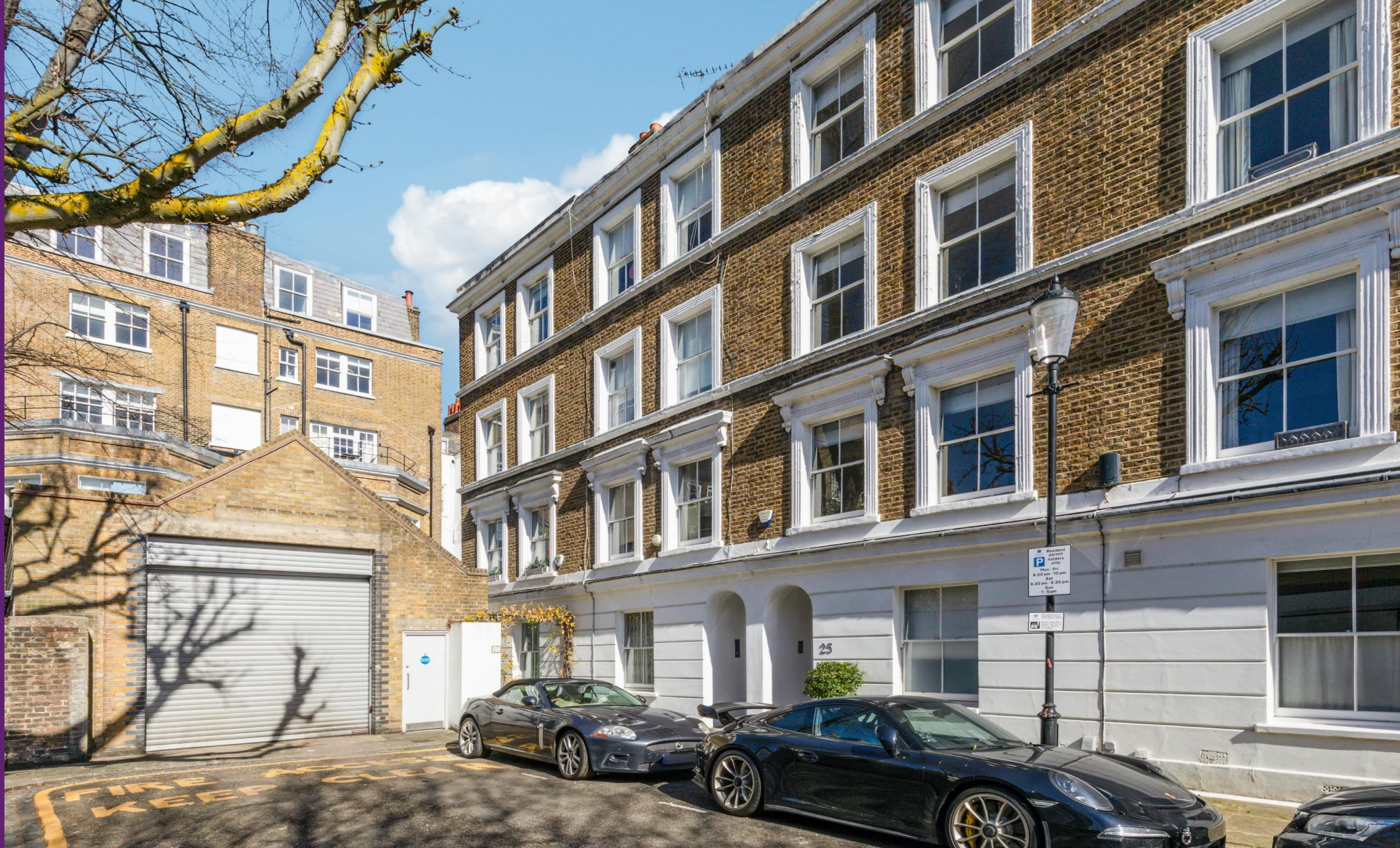
Ansdel Terrace Kensington, W8