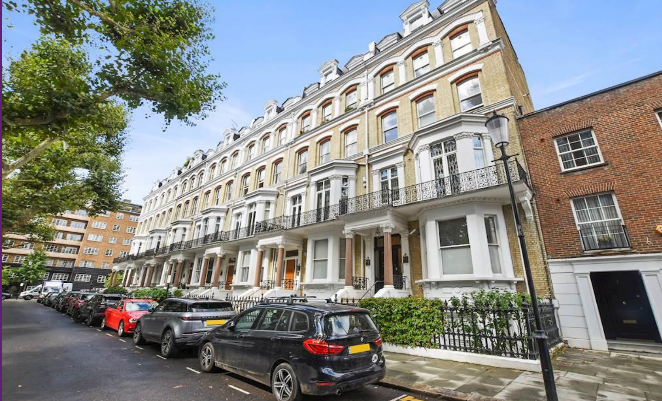
Vicarage Gate Kensington, W8