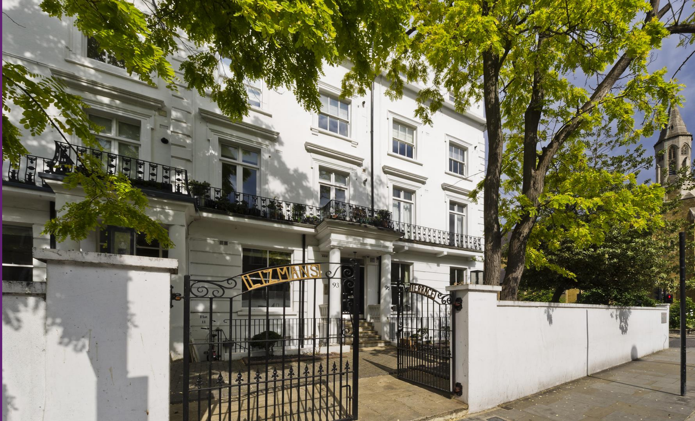
Lizmans Terrace Earls Court Road, W8