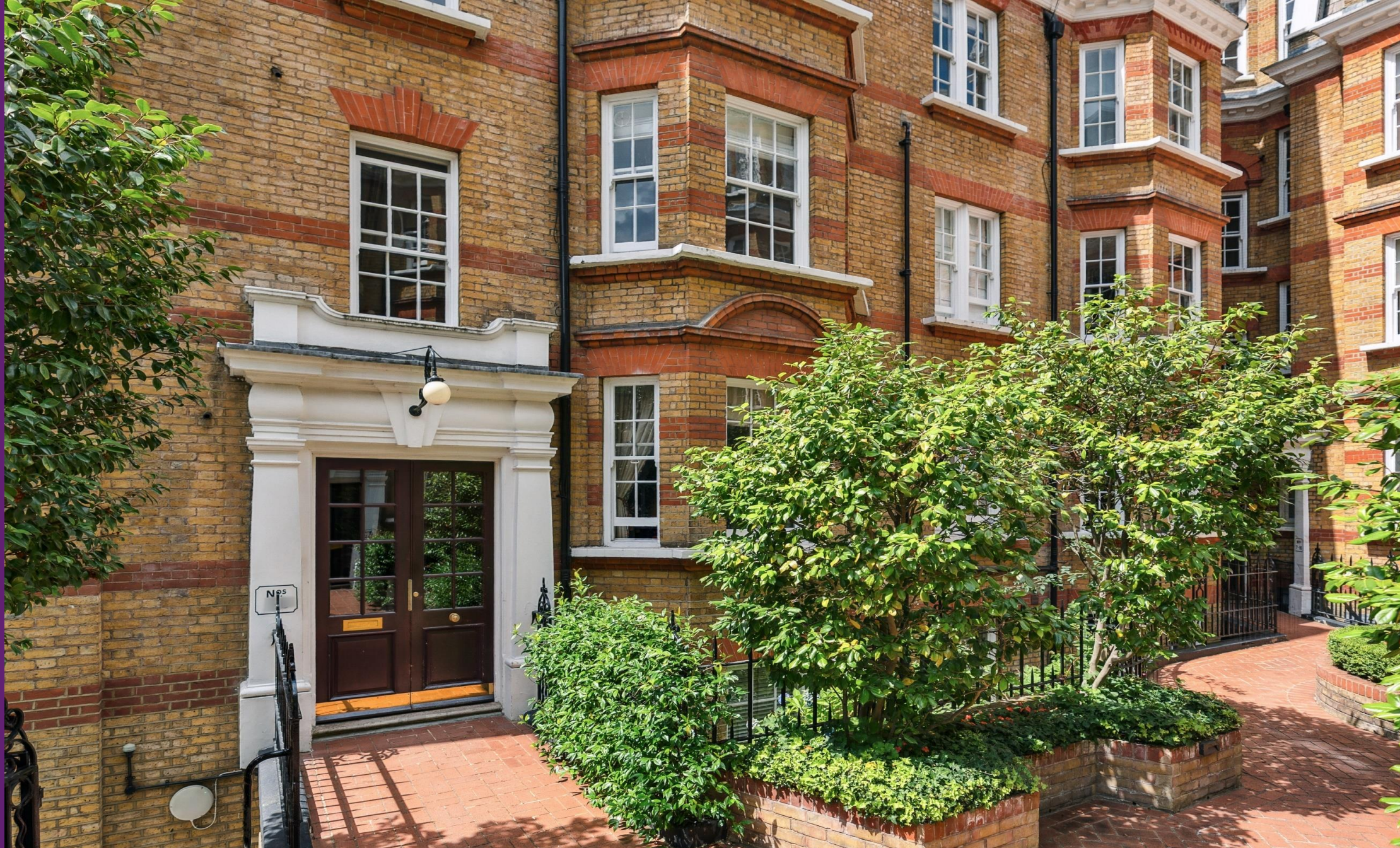
Bullingham Mansions Kensington, W8