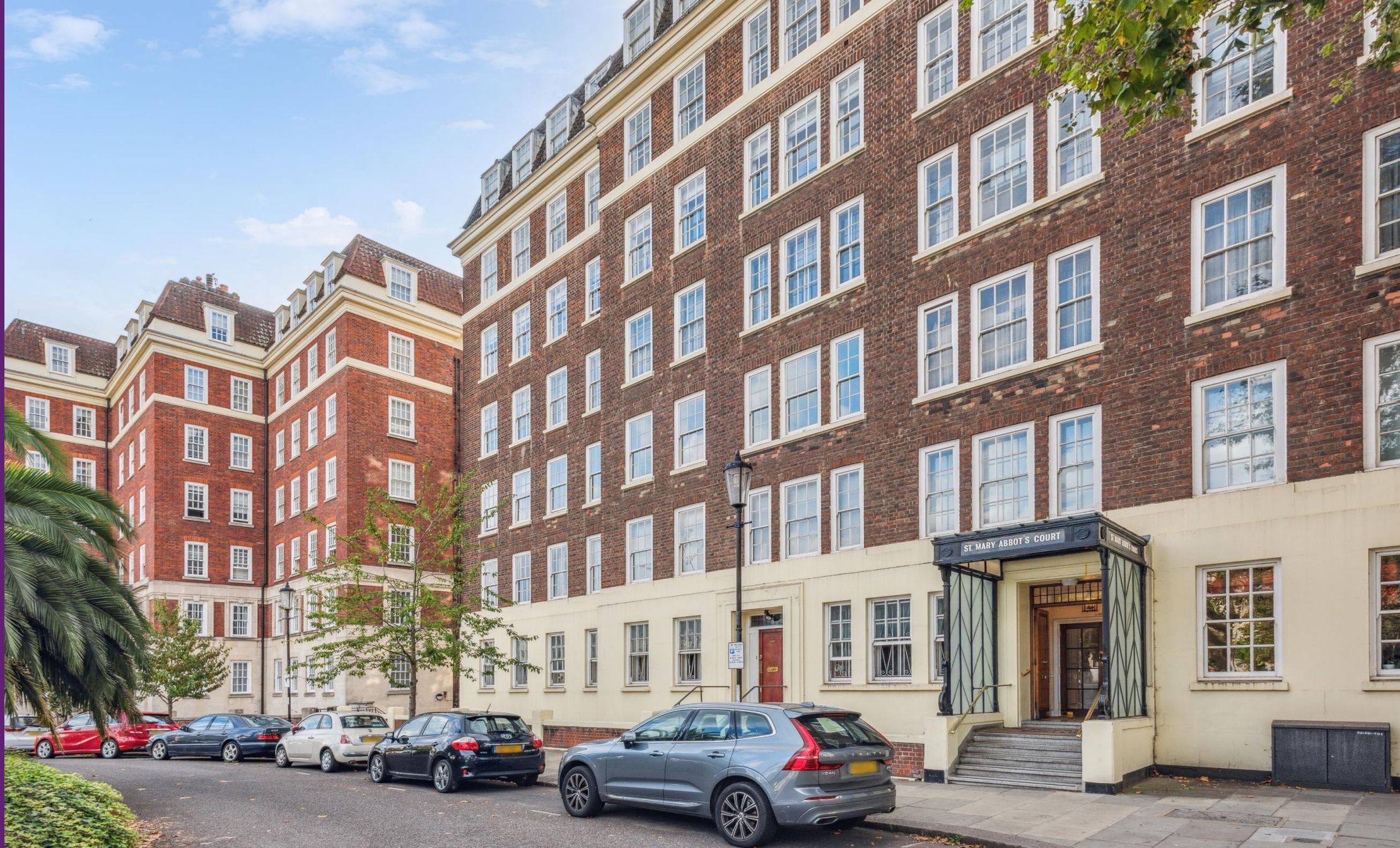
Warwick Gardens Kensington, W14