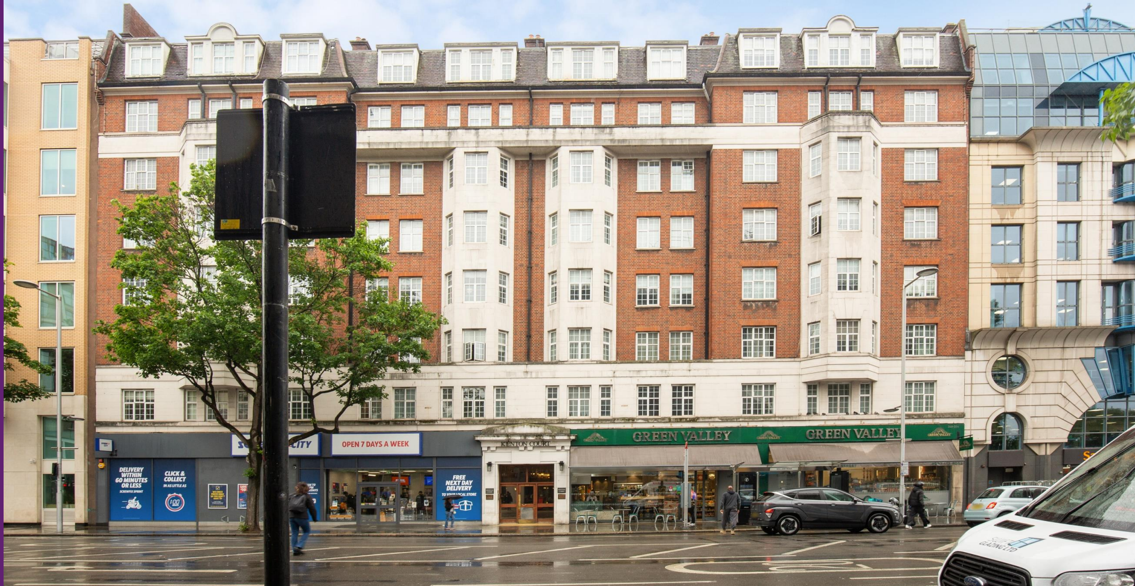
Kenton Court Kensington High Street, W14