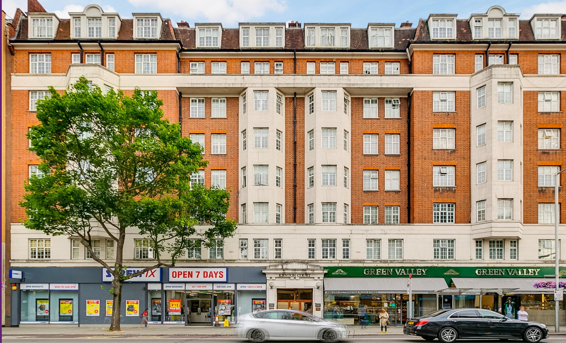
Kenton Court Kensington High Street, W14