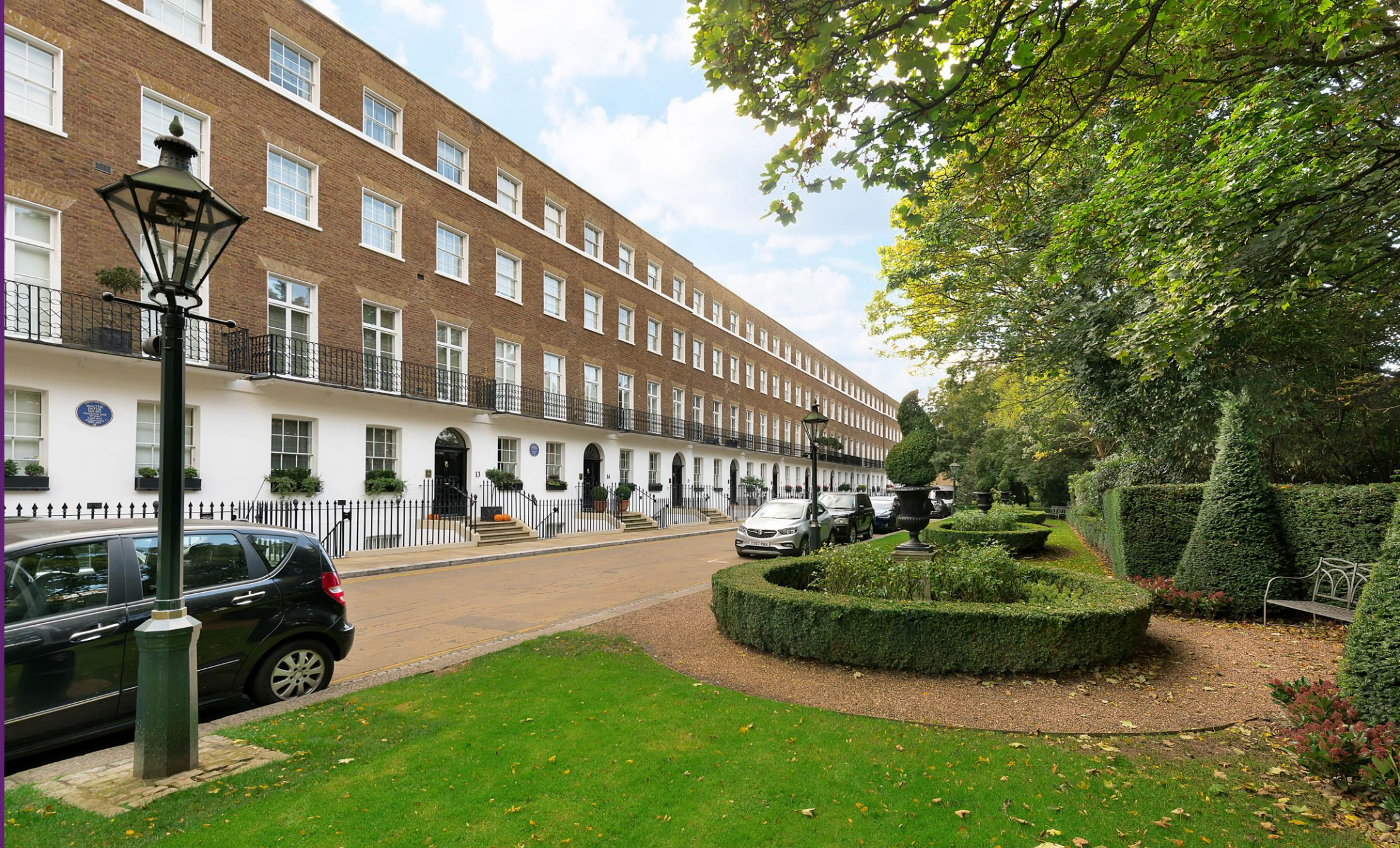
Earls Terrace Kensington, W8