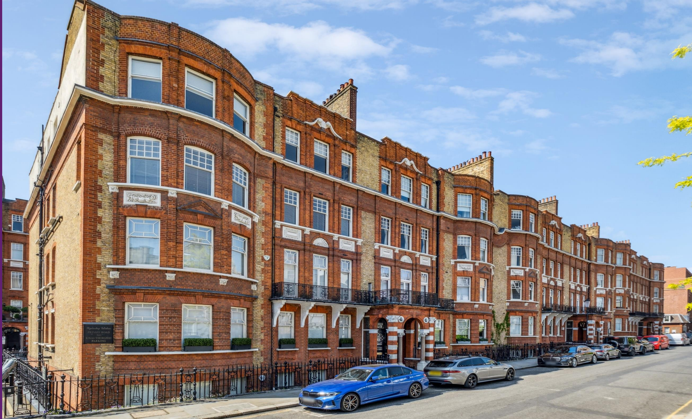
Wynnstay Gardens Kensington, W8