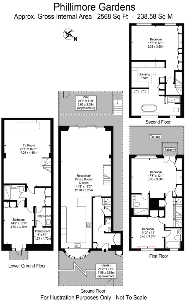
This floor plan should be used as a general outline for guidance only and does not constitute in whole or in part an offer or contract. Any intending purchaser or lessee should satisfy themselves by inspection, searches, enquiries and full survey as to the correctness of each statement. Any areas, measurements or distances quoted are approximate and should not be used to value a property or be the basis of any sale or let.

Chesterton UK Services Limited trading as Chestertons for themselves and for the vendor of this property whose agents they are, give notice that (i) these particulars do not constitute any part of an offer or contract,(ii) all statements contained within these particulars are made without responsibility on the part of Chestertons or the vendor, (iii) whilst made in good faith, none of the statements contained within these particulars are to be relied upon as a statement or representation of fact, (iv) any intending purchasers must satisfy themselves by inspection or otherwise as to the correctness of each of the statements contained within these particulars, (v) the vendor does not make or give either Chestertons or any person in their employment any authority to make or give representation or warranty whatsoever in relation to this property. Wide angle lenses may be used. @Copyright Chestertons | Chesterton UK Services Limited | Registered Office 40 Connaught Street, Hyde Park, London W2 2AB Registered Company Number 05334580.