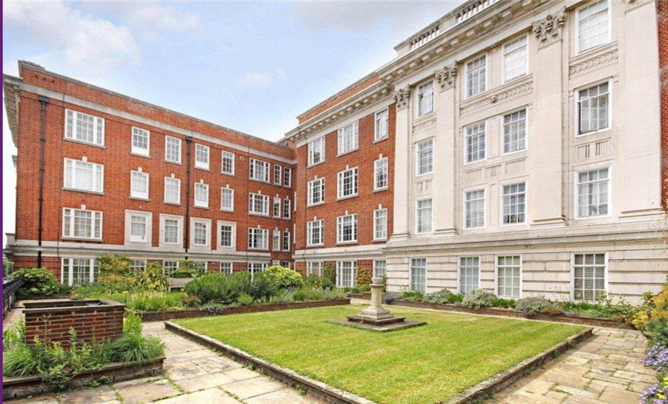
Phillimore Court Kensington, W8