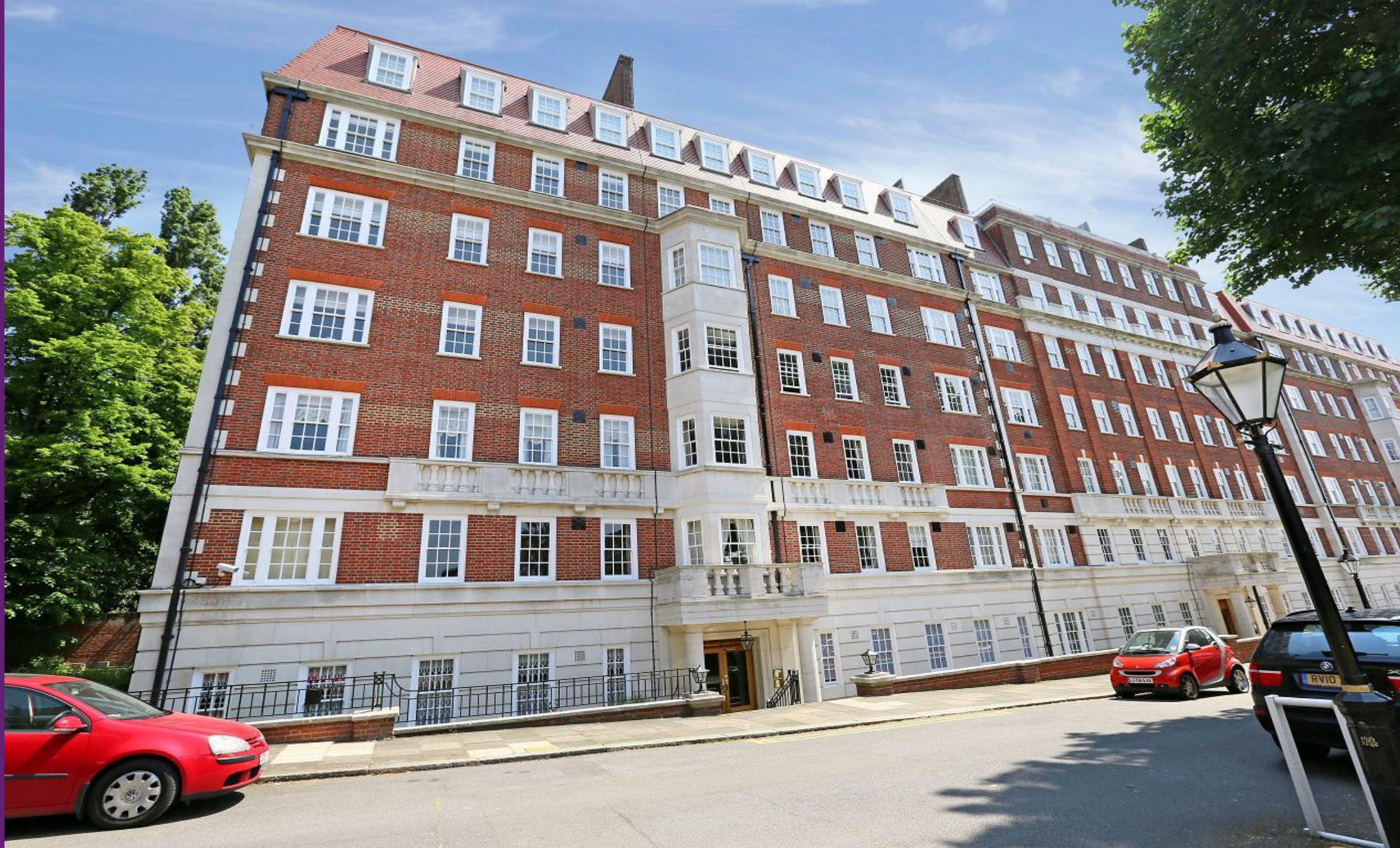
Duchess of Bedfords Walk Kensington, W8