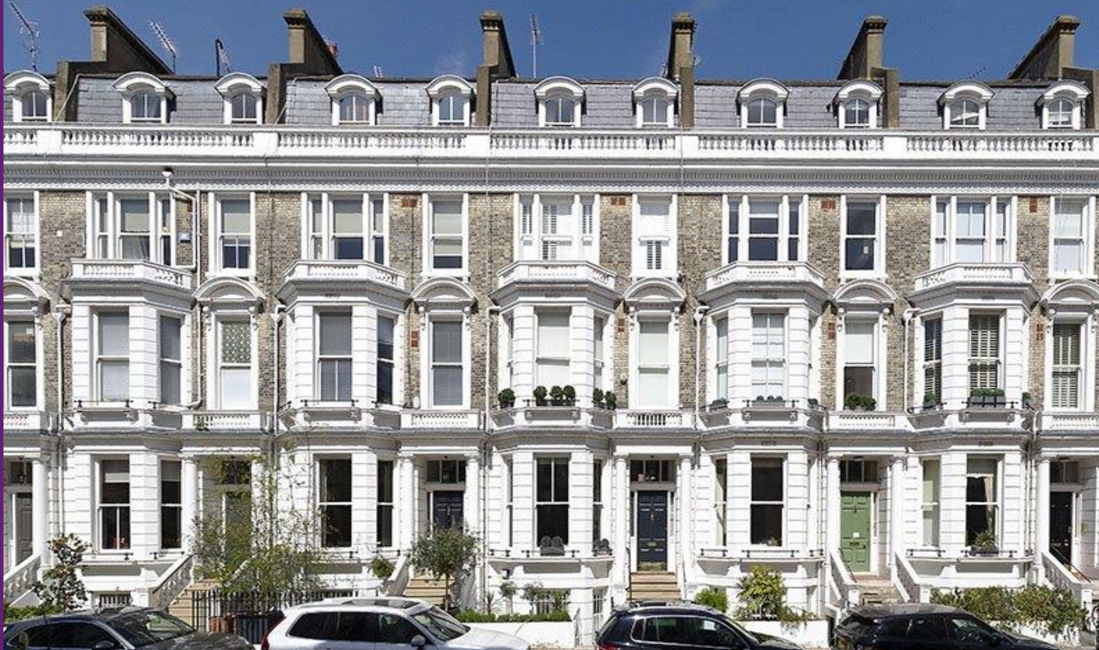
Stafford Terrace Kensington, W8