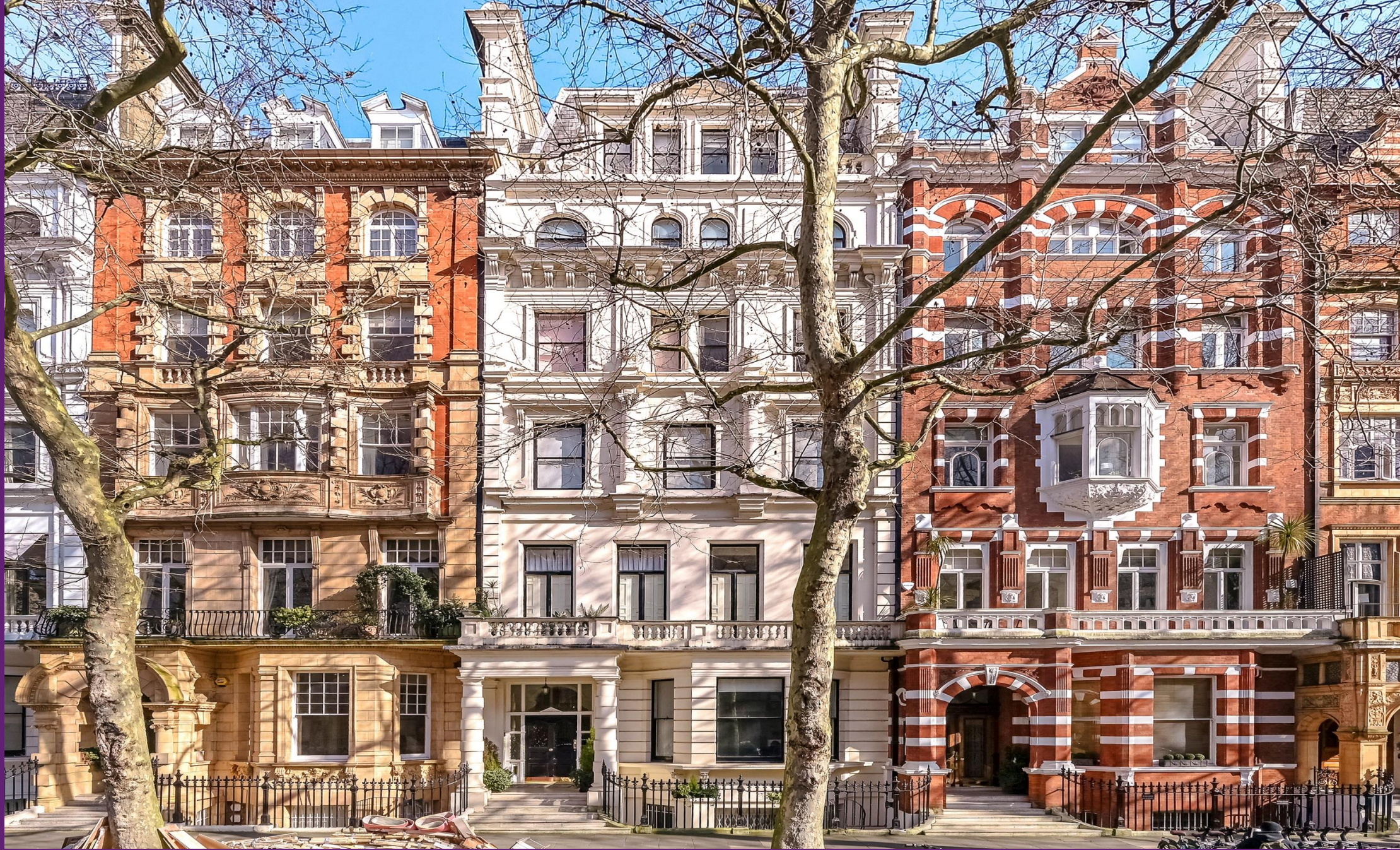
Queen's Gate Kensington, SW7