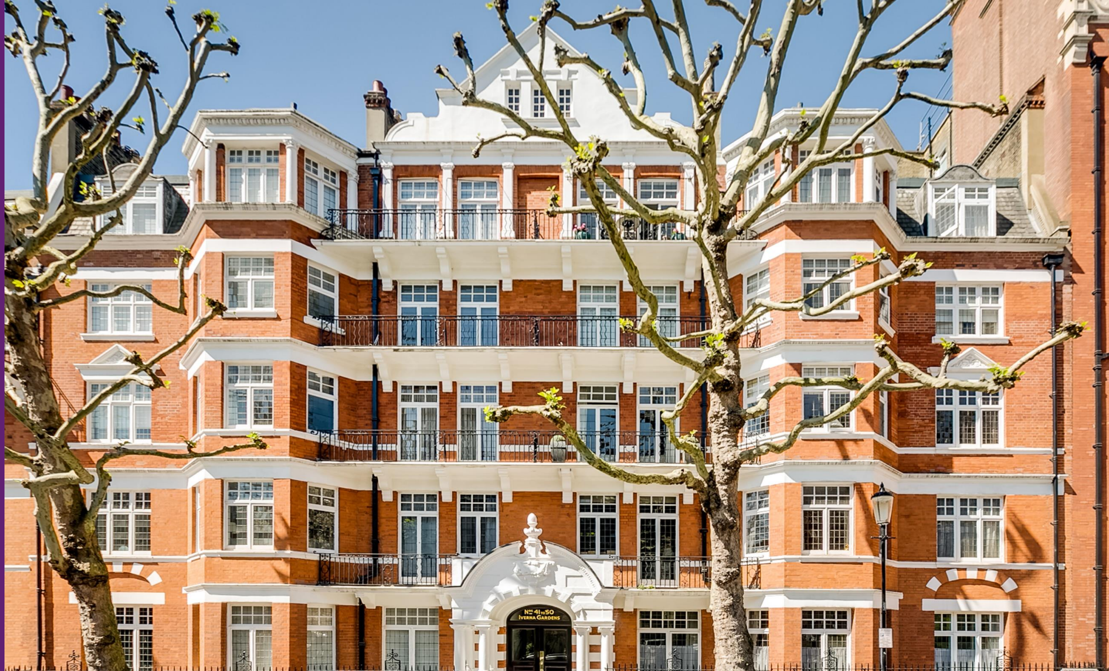
Iverna Gardens Kensington, W8