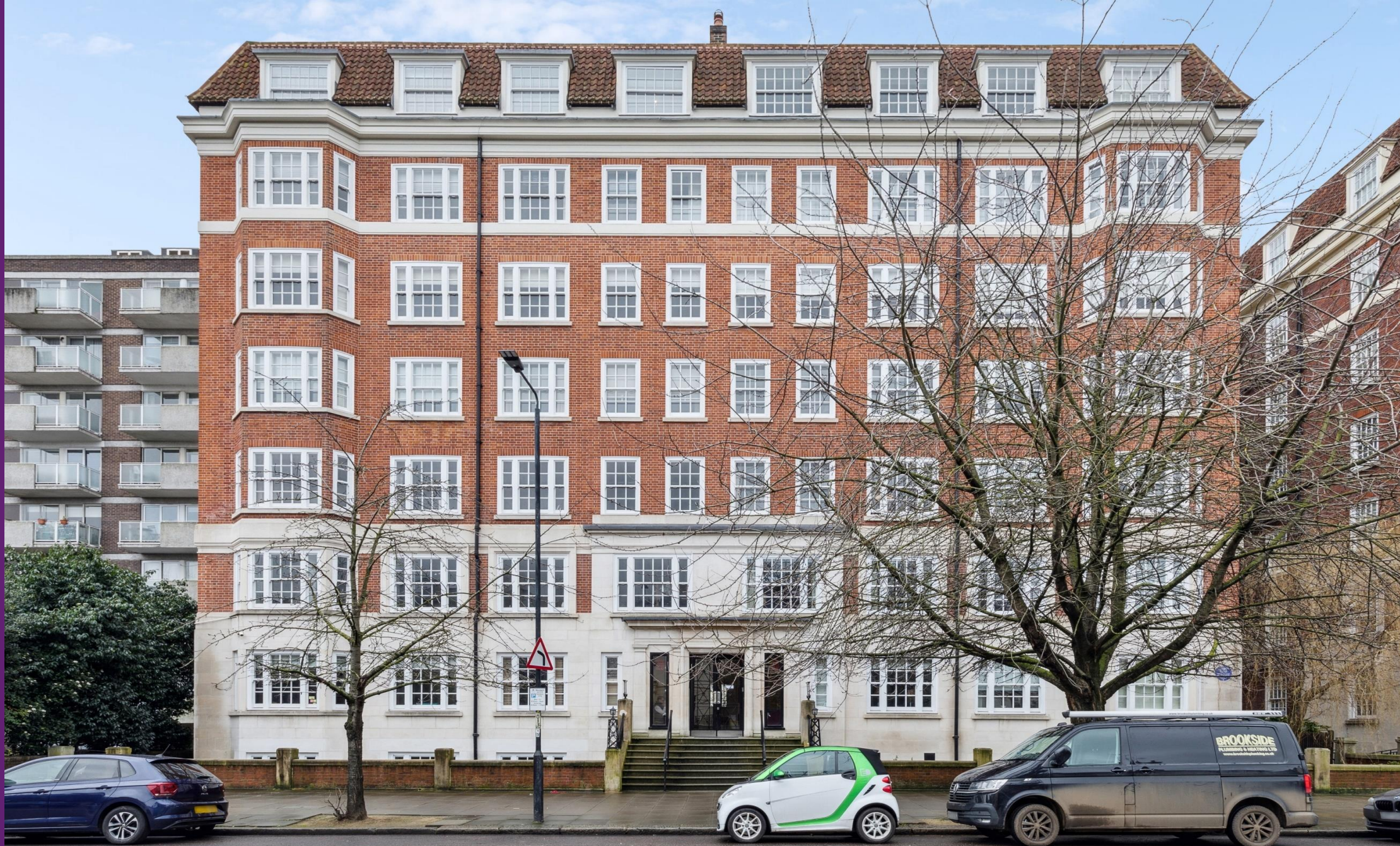
Warwick Gardens Holland Park, W14