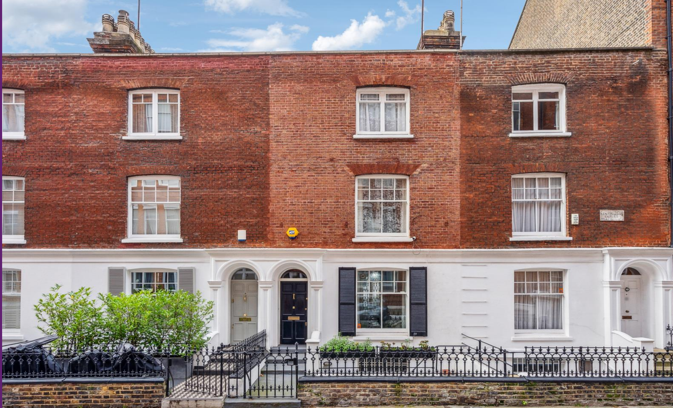
Kensington Court Place Kensington, W8