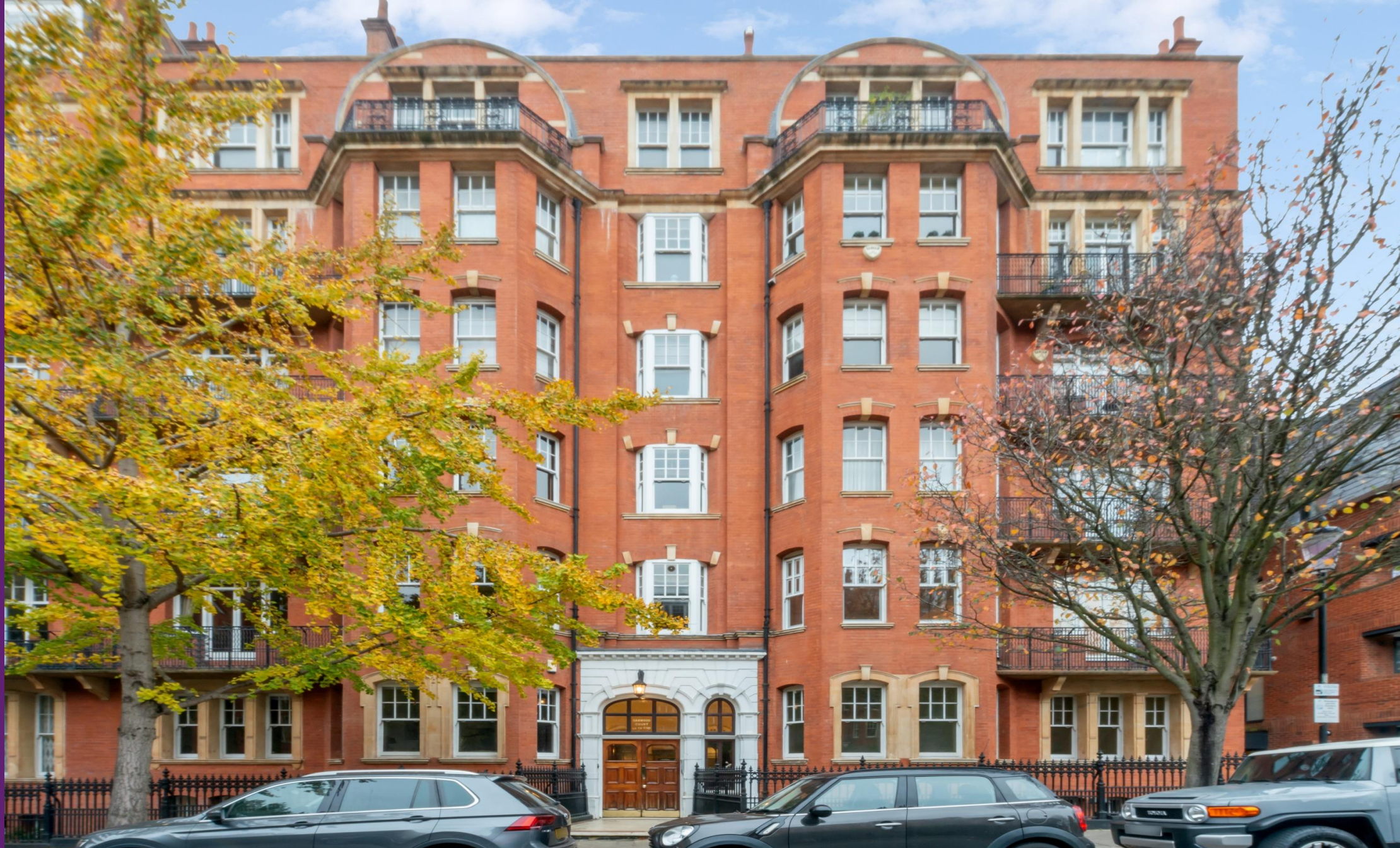
Oakwood Court Kensington, W14