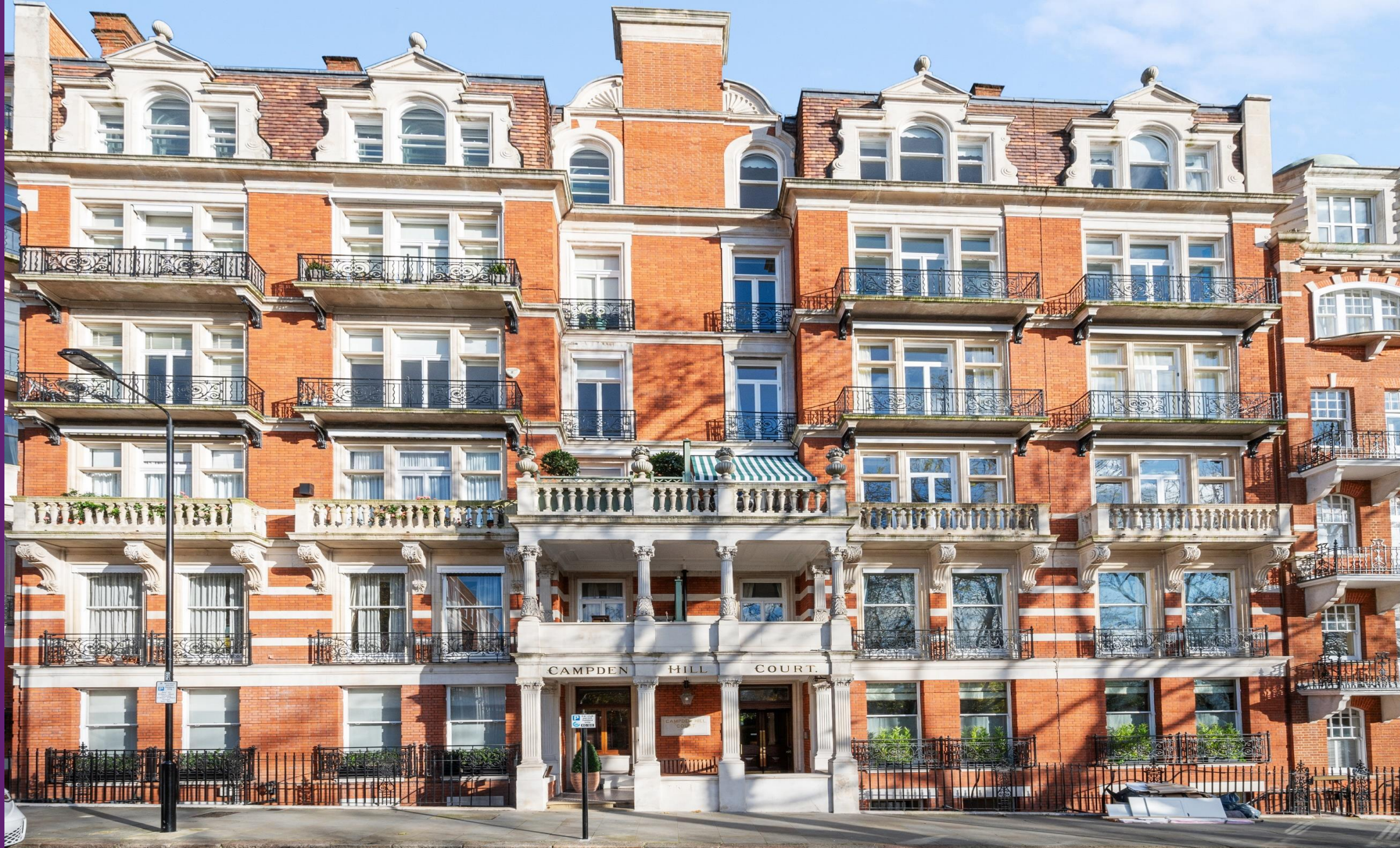
Campden Hill Court Campden Hill Road, W8