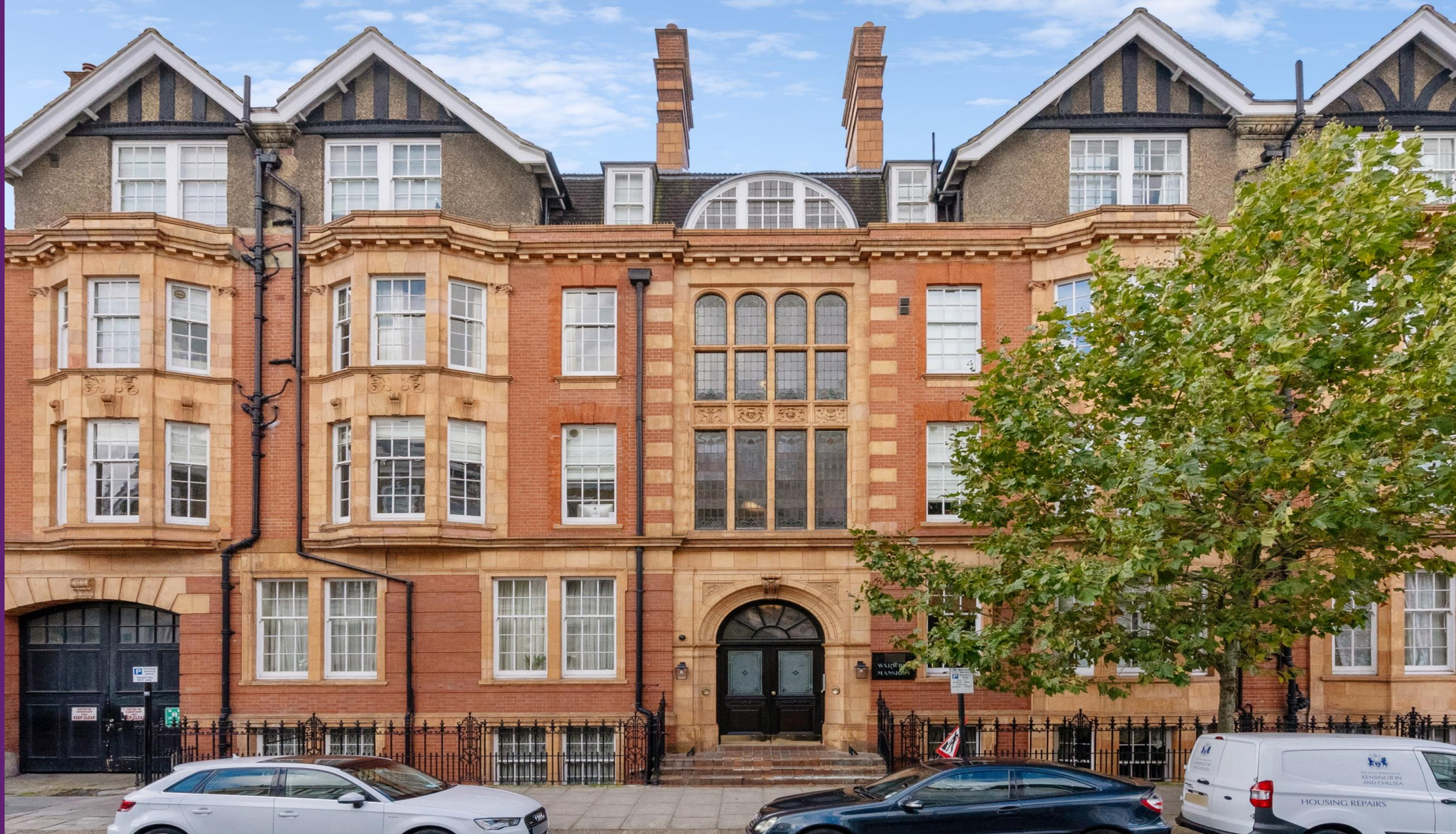
Warwick Mansions Kensington, SW5