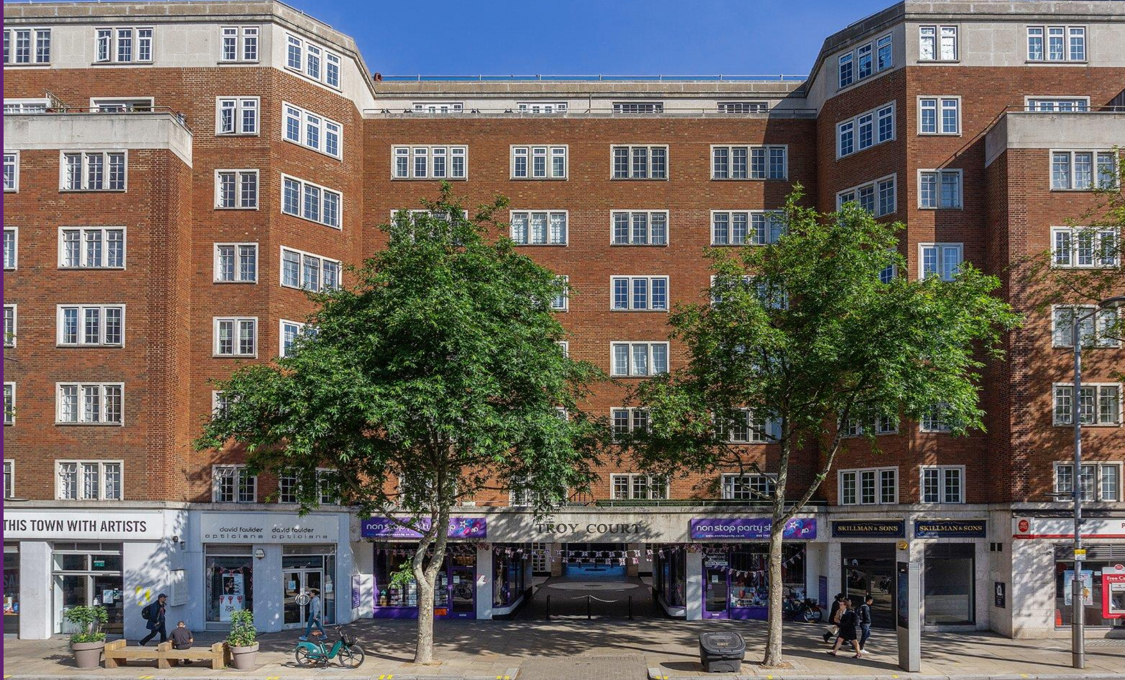
Troy Court Kensington, W8