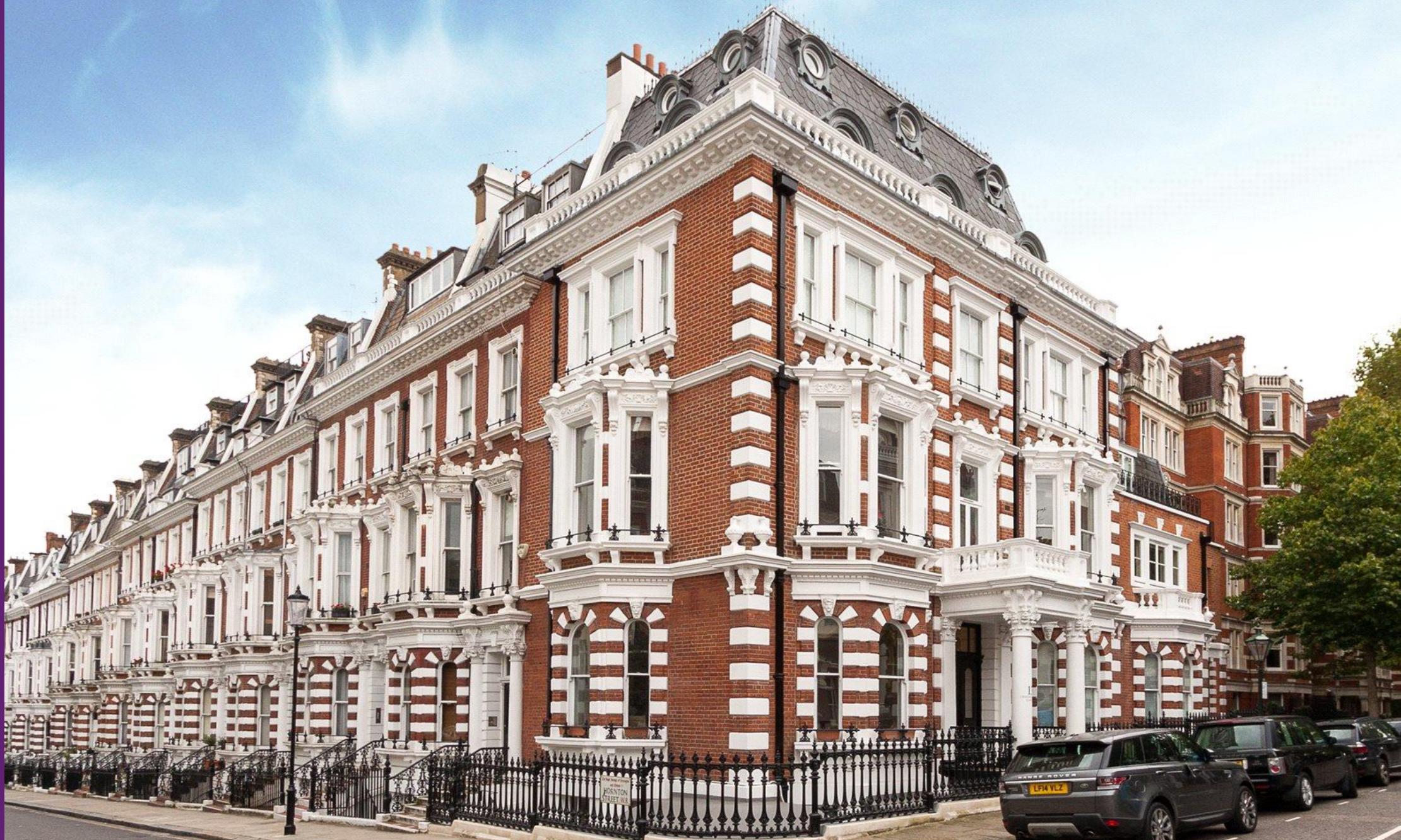
Observatory Gardens Kensington, W8