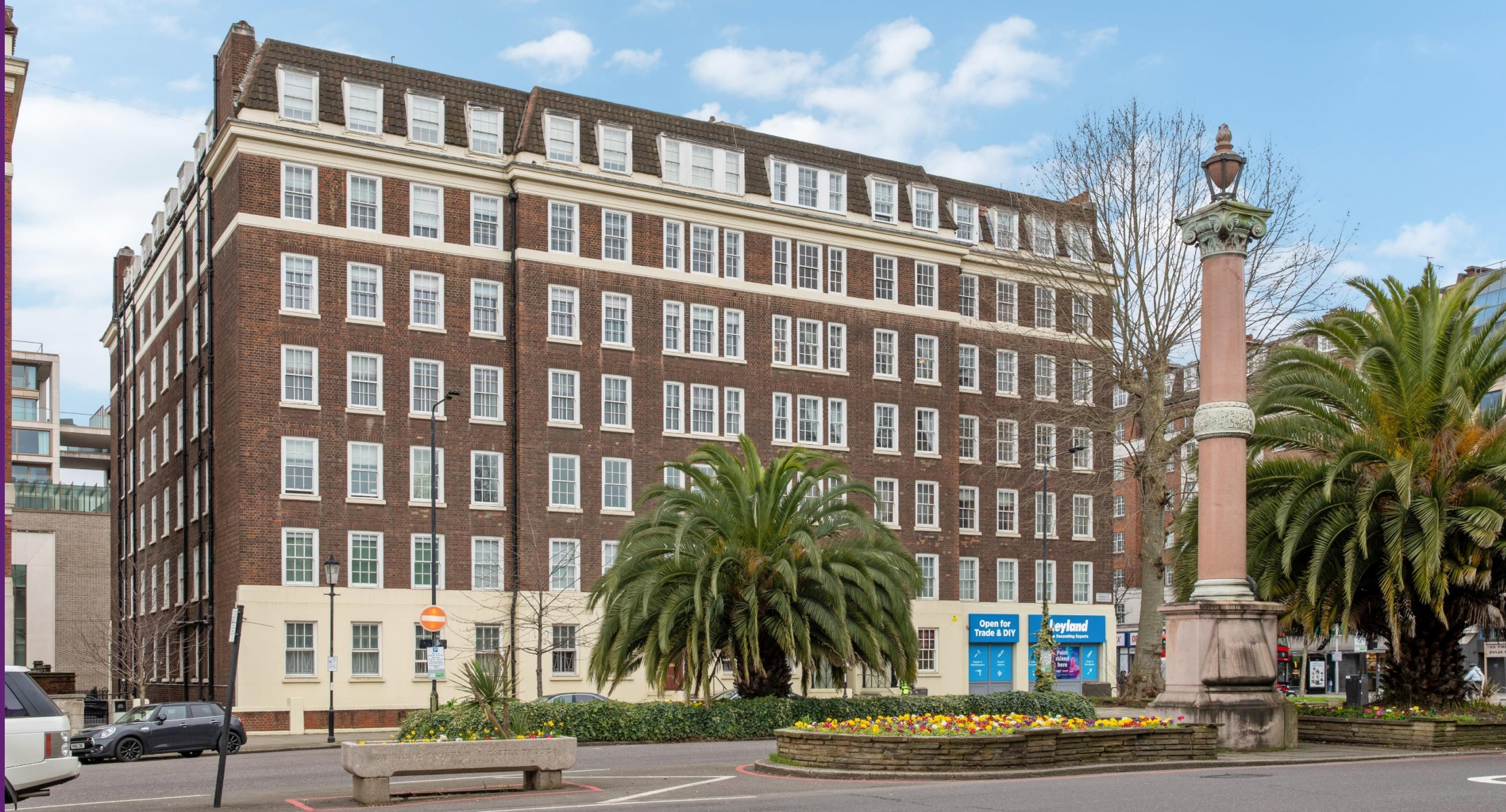
Warwick Gardens Kensington, W14