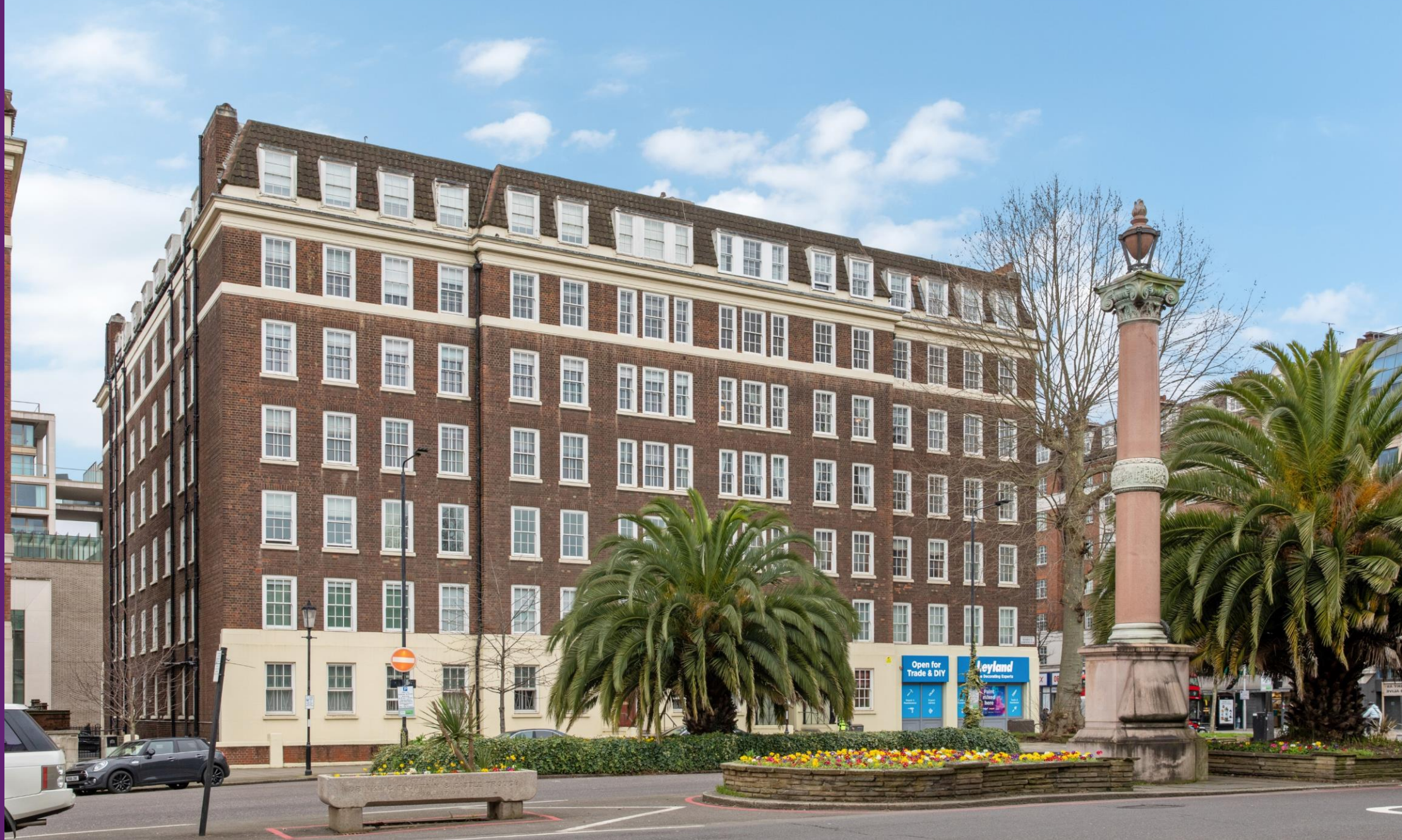
Warwick Gardens London, W14