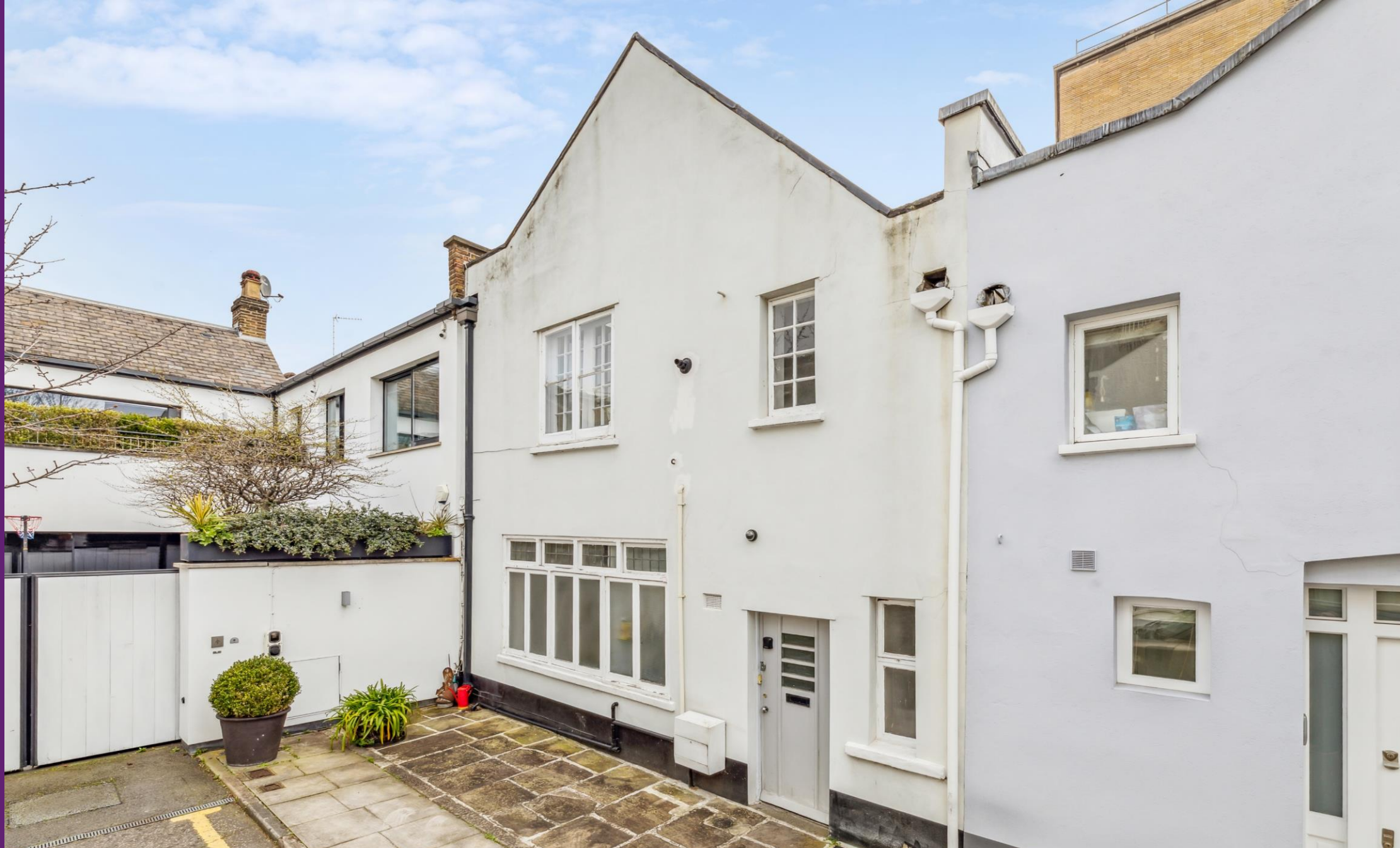
Kelso Place London, W8