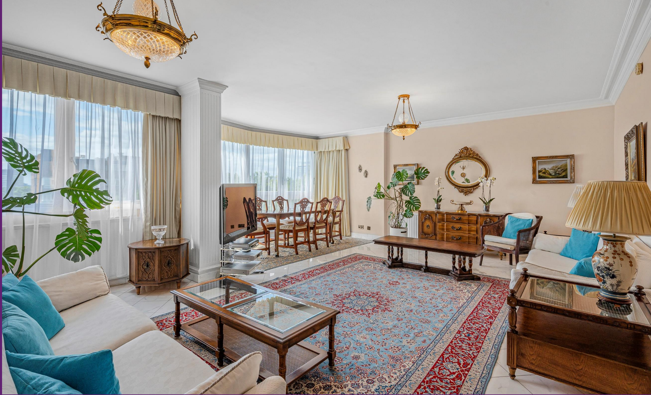
Raynham Norfolk Crescent, W2