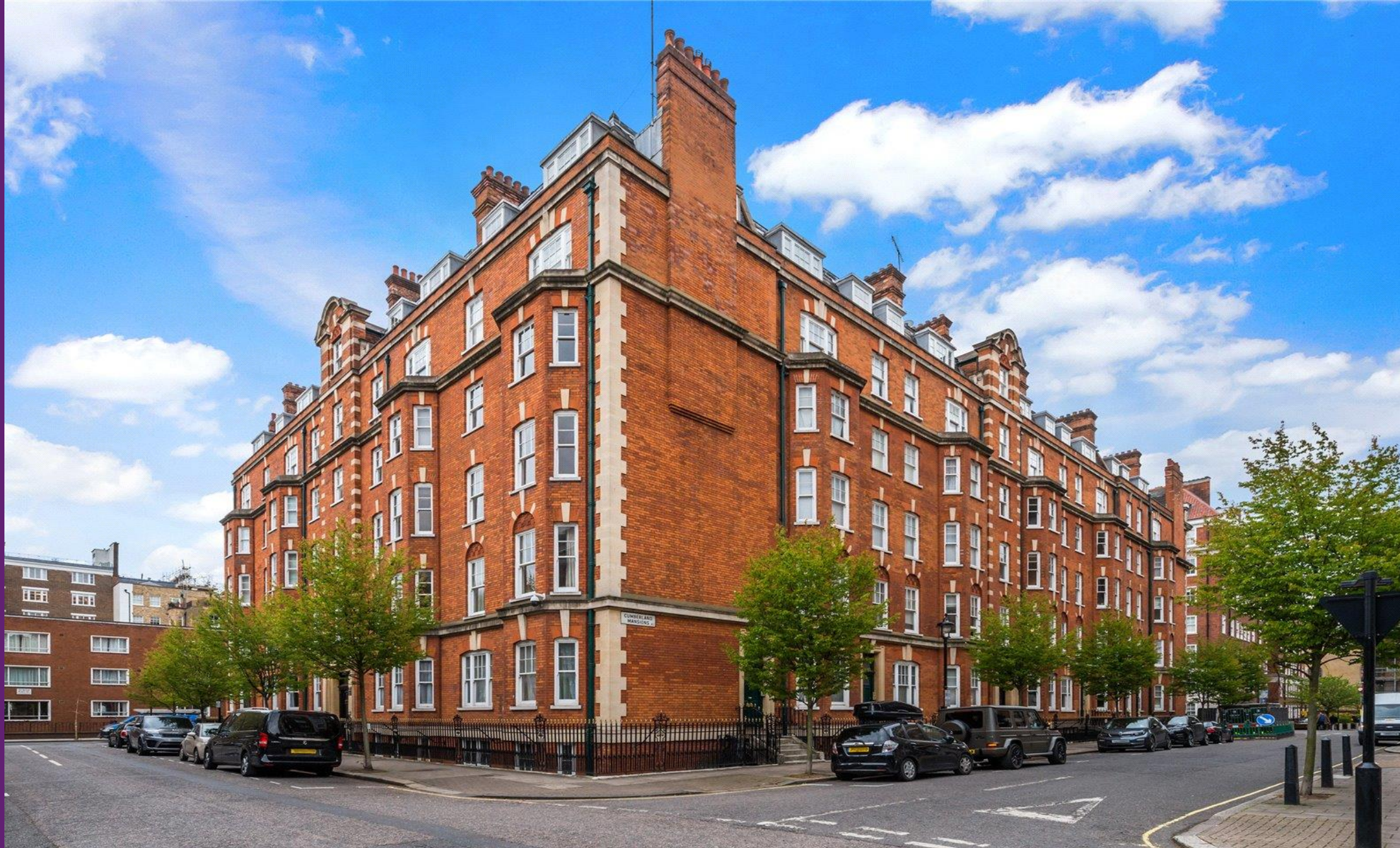
Cumberland Mansions Brown Street, W1H