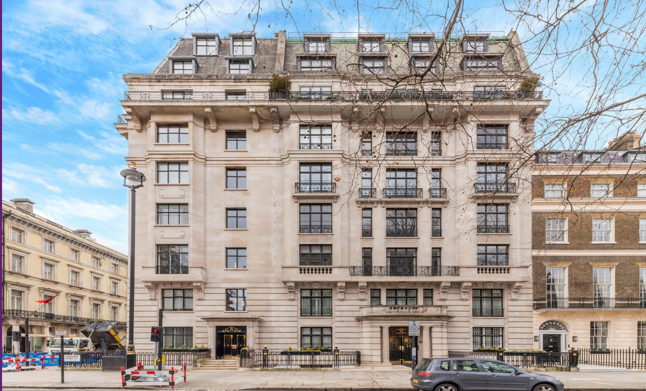
Portland Place Marylebone, W1B