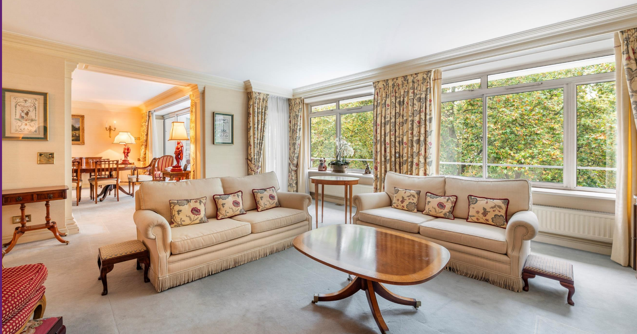
Chelwood House Gloucester Square, W2