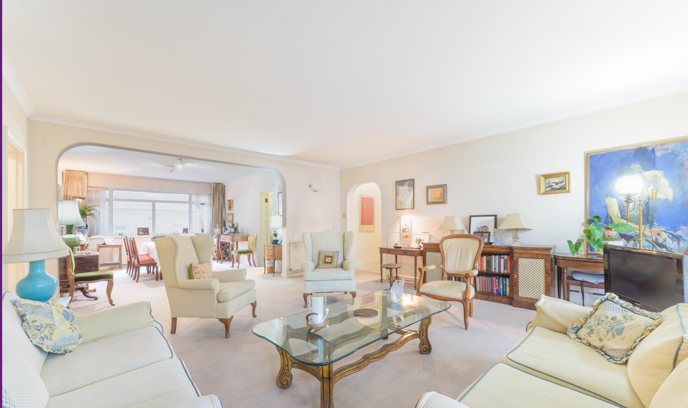
Chelwood House Gloucester Square, W2