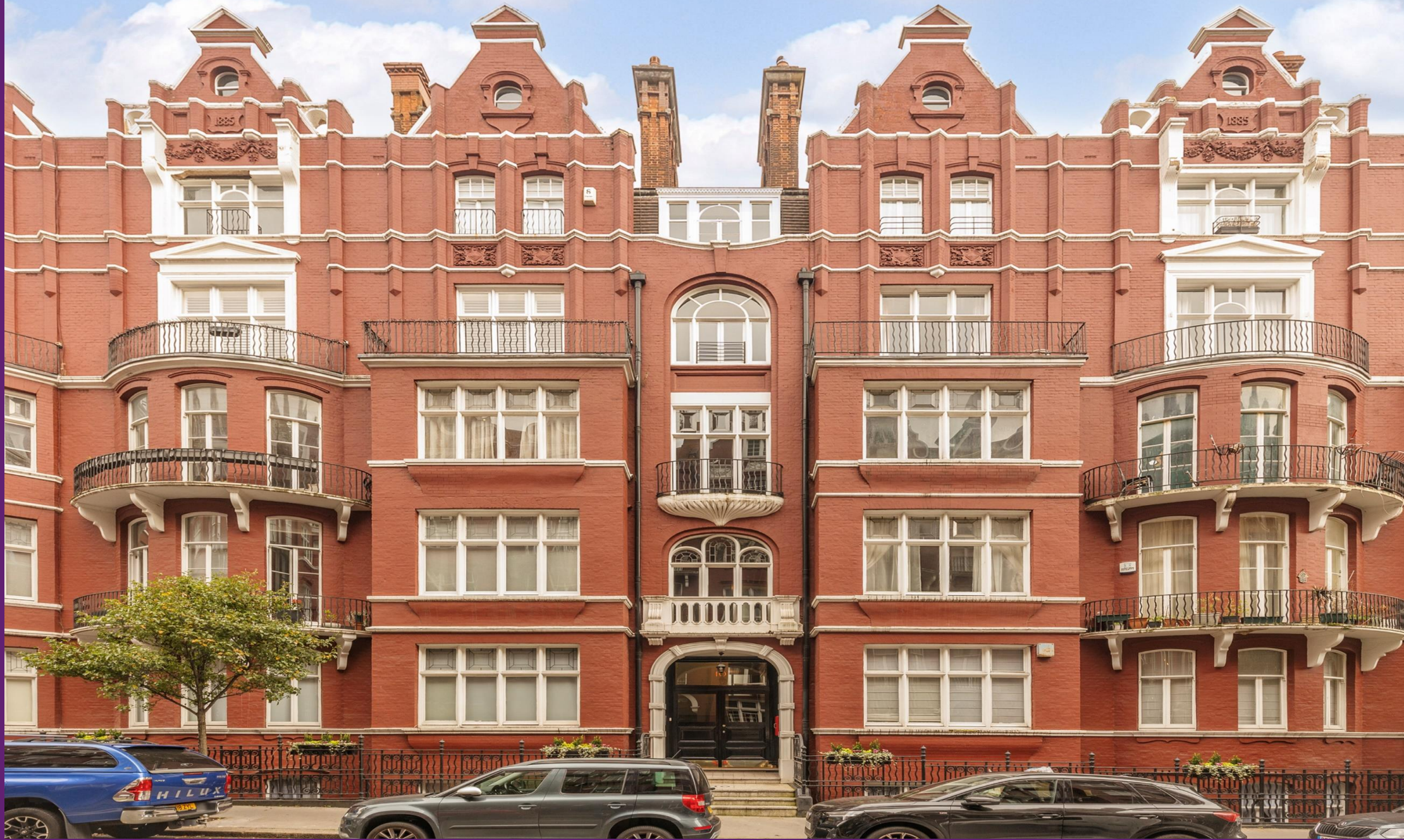
Hyde Park Mansions Cabbell Street, NW1