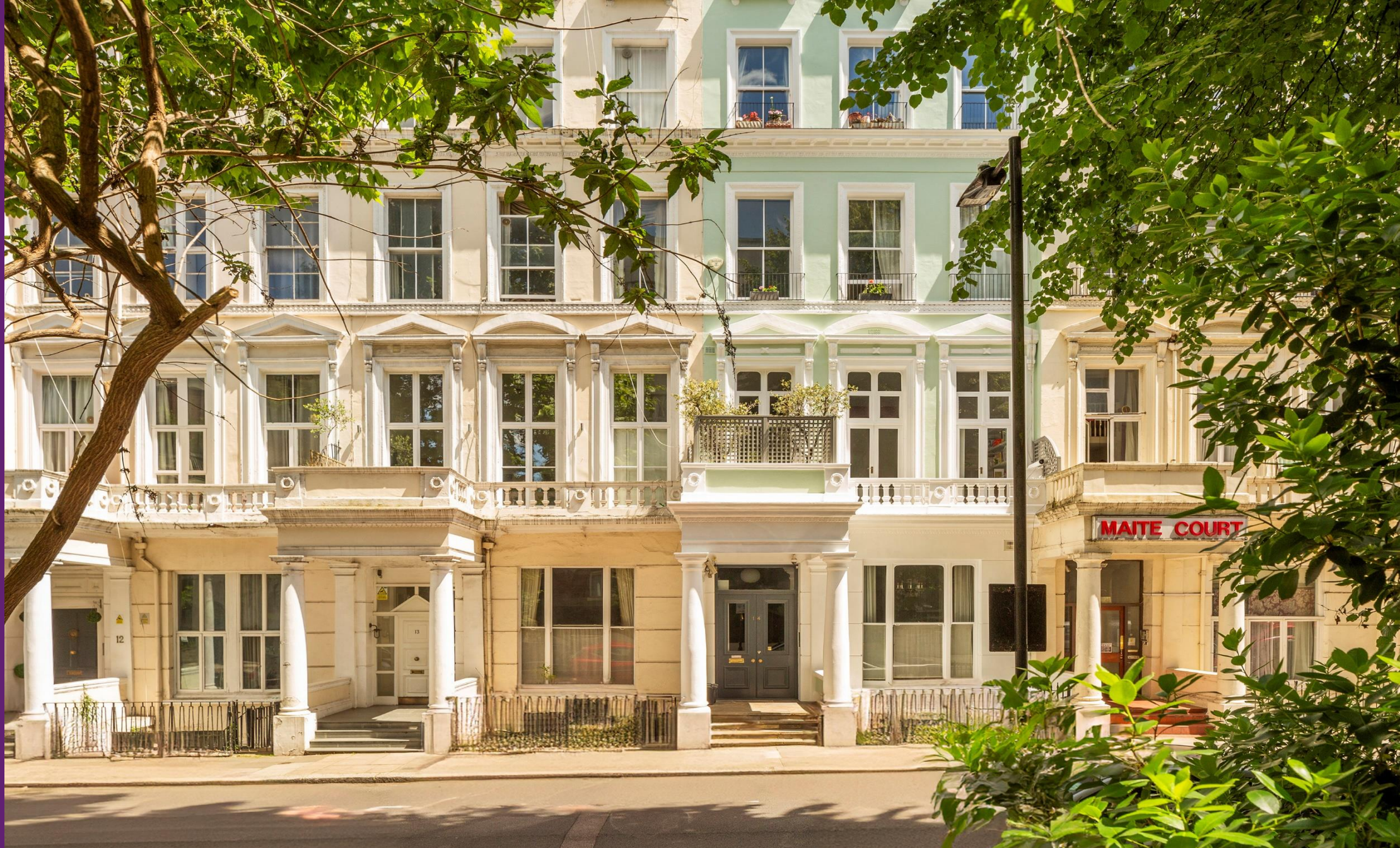
Leinster Gardens Bayswater, W2