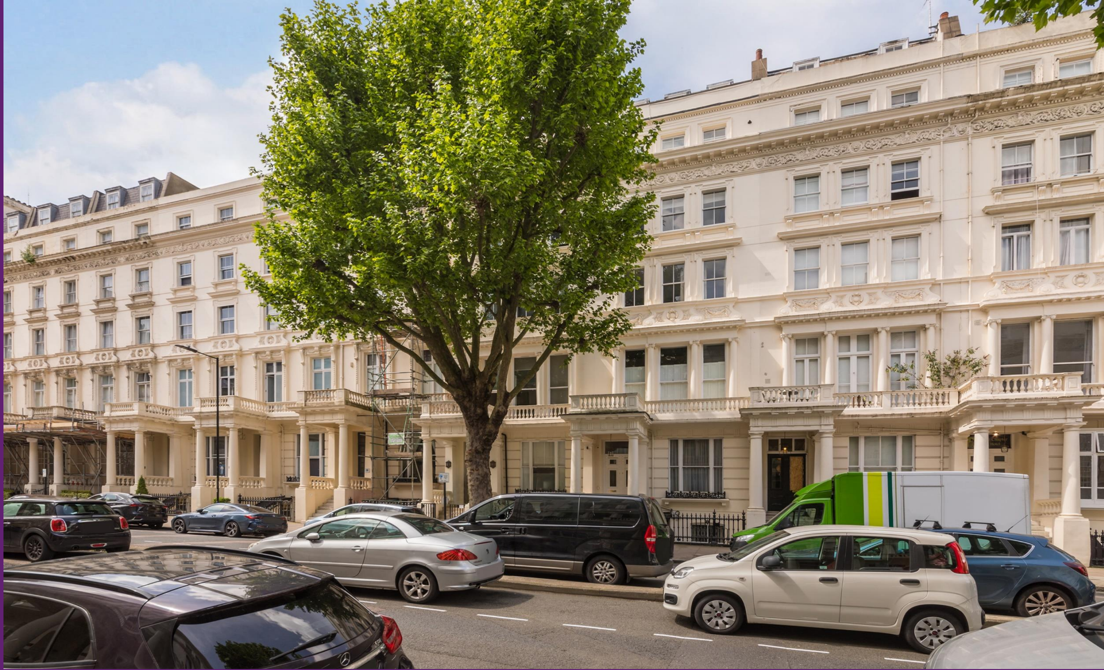
Inverness Terrace Bayswater, W2