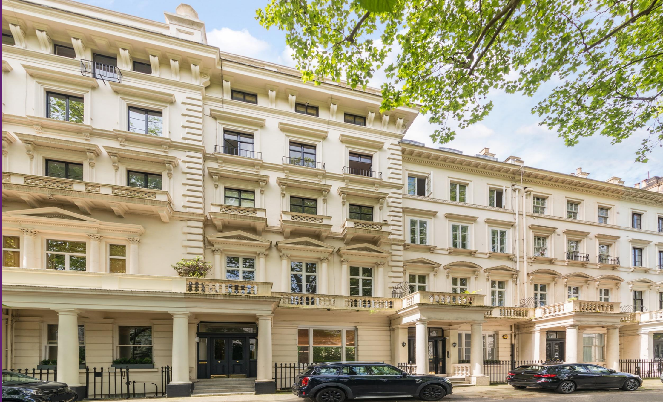
Westbourne Terrace London, W2