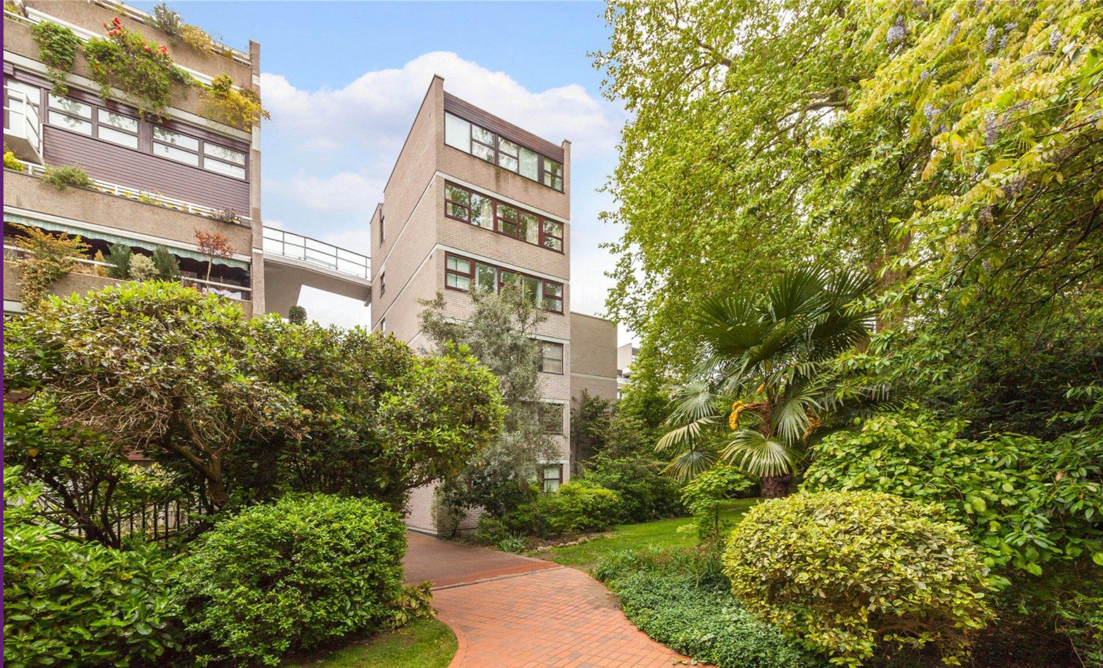
West Rise St Georges Fields, W2