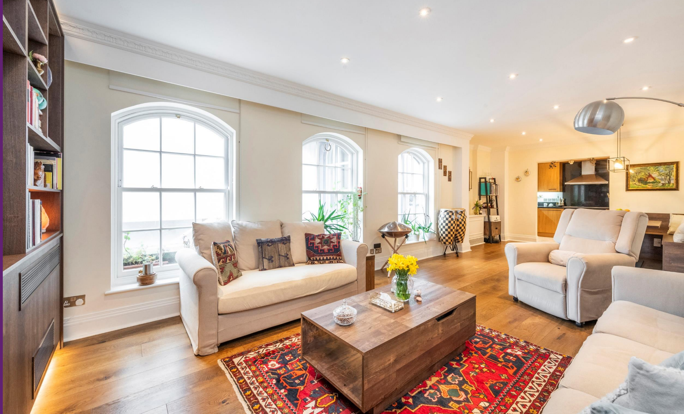
Sager House Seymour Street, Marylebone, W1H