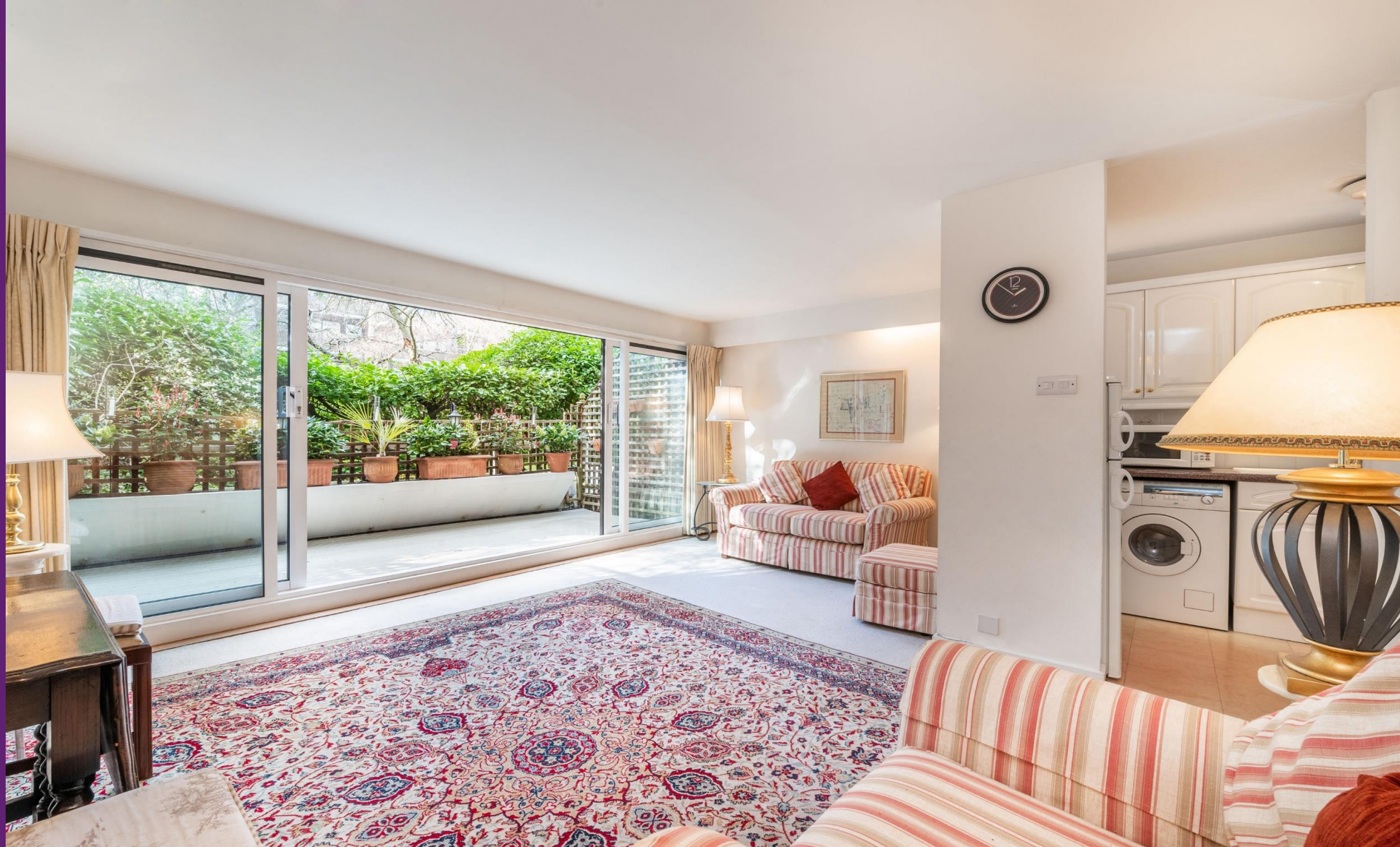
Archery Steps St. Georges Fields, W2