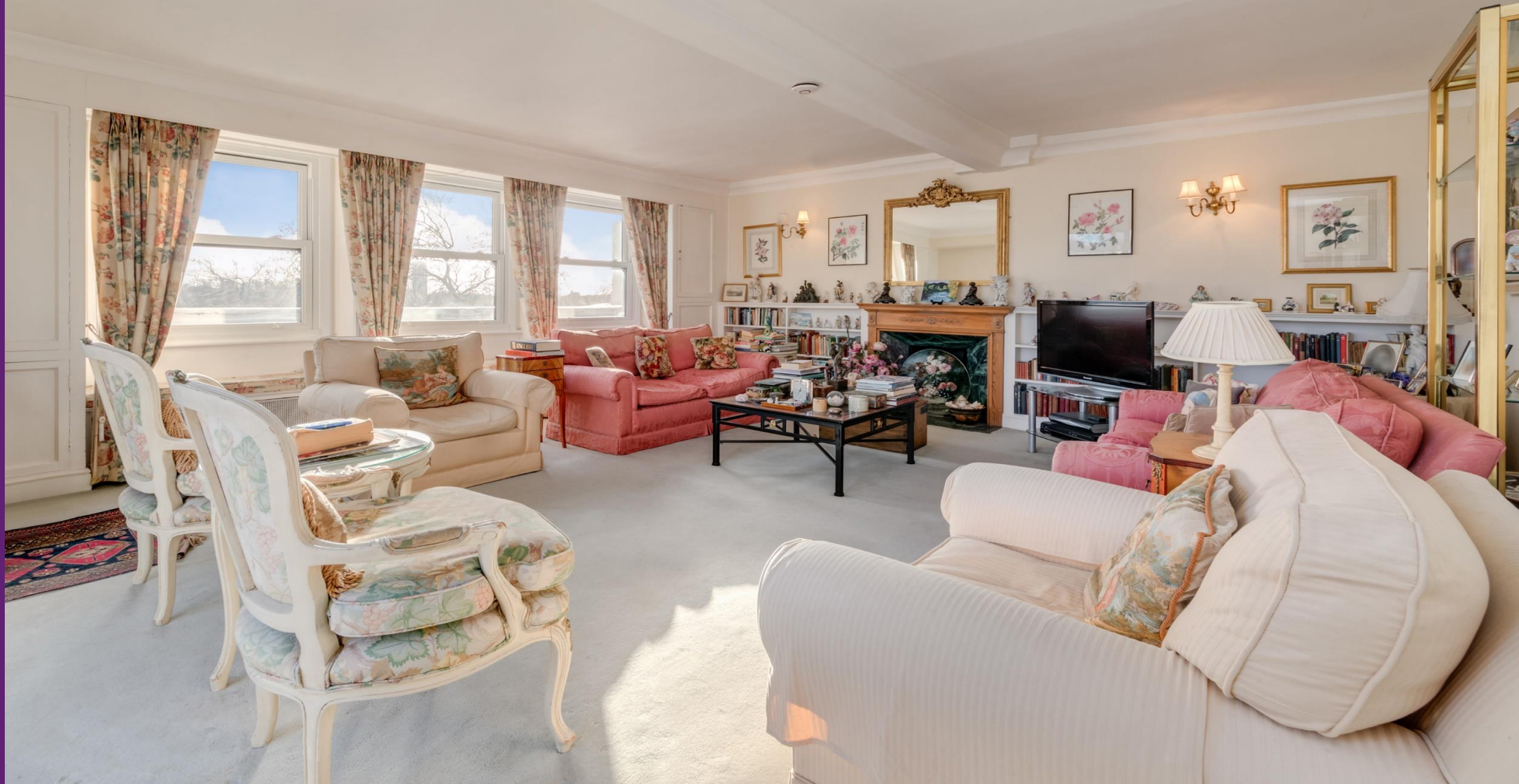
Hyde Park Gardens Hyde Park, W2