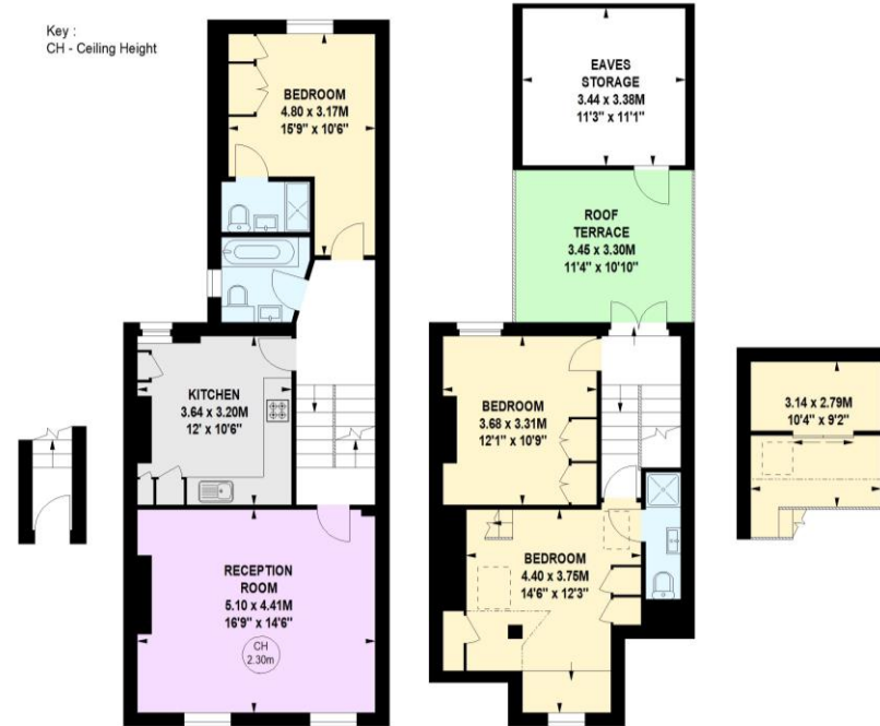
Ground Floor Entrance